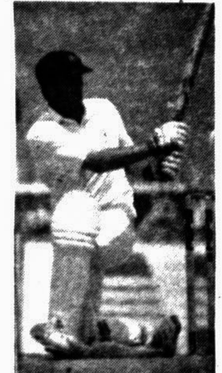
S WAUGH ... 70 n.o.

Fast bowler Chaminda Vaas, who inflicted the early damage by removing Slater with the second ball of the match, also sent back captain