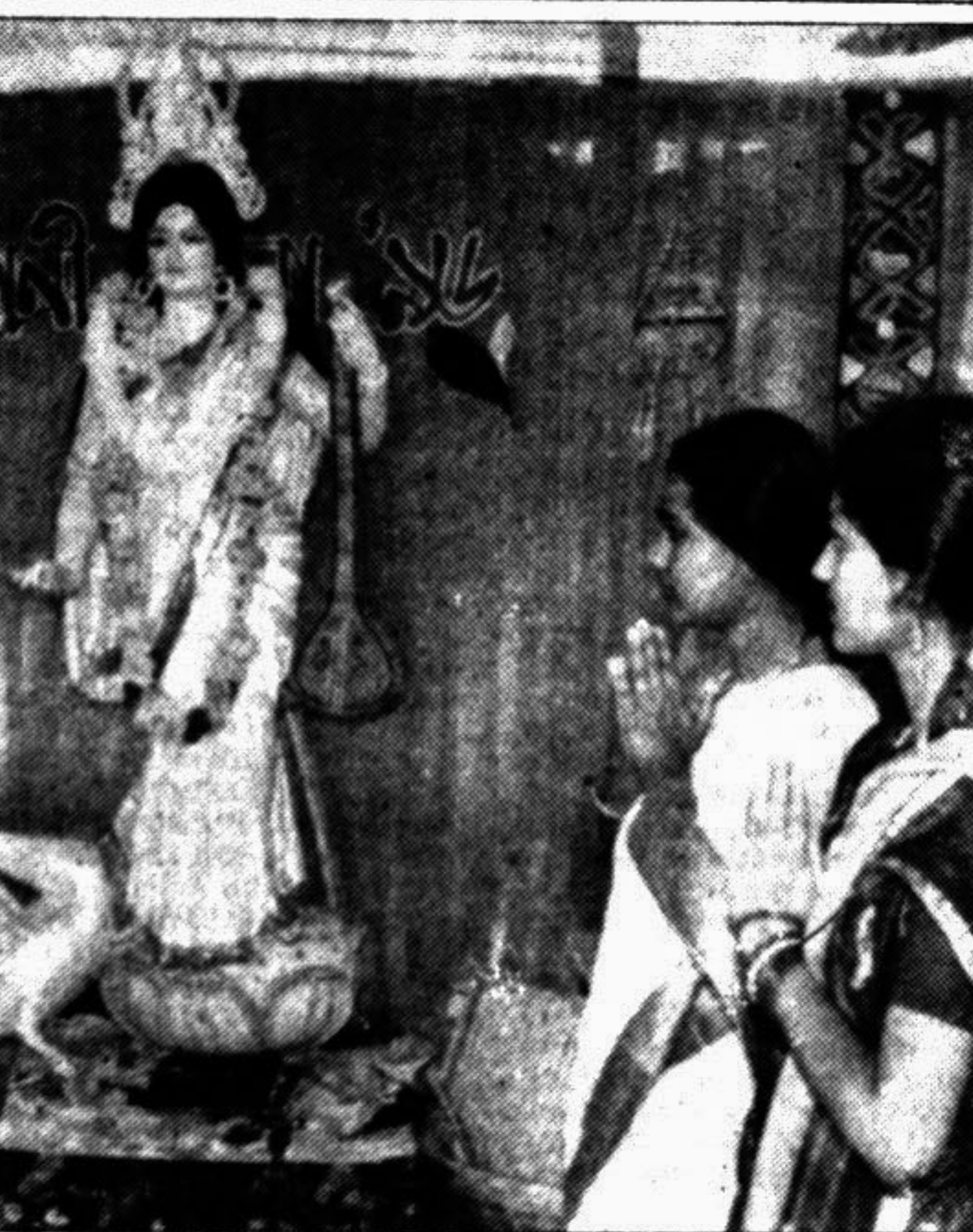
Devotees at Saraswati Puja mandop at Rokeya Hall in the city yesterday.

Lions Club of Dhaka Pallabi: The board of directors of the club will meet. Venue: 1/C, 6/10, Mirpur. Time: 4 pm.