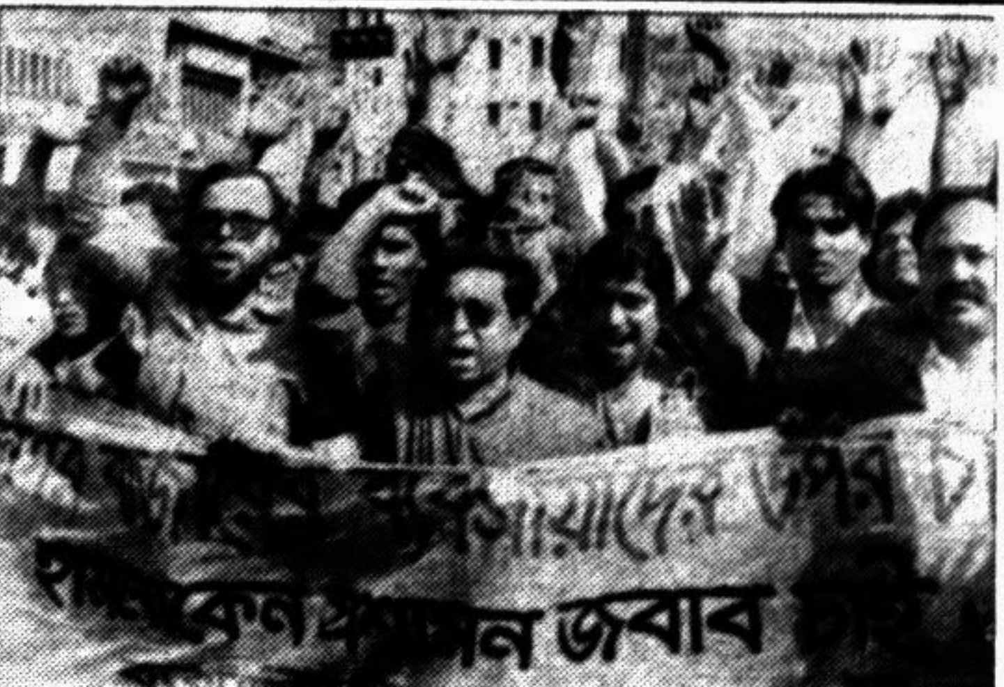
Traders of Shantinagar Bazar brought out a procession in the city yesterday protesting the murder of a fellow businessman.

Poet Shamsur Rahman will preside over the inaugural session of the festival.