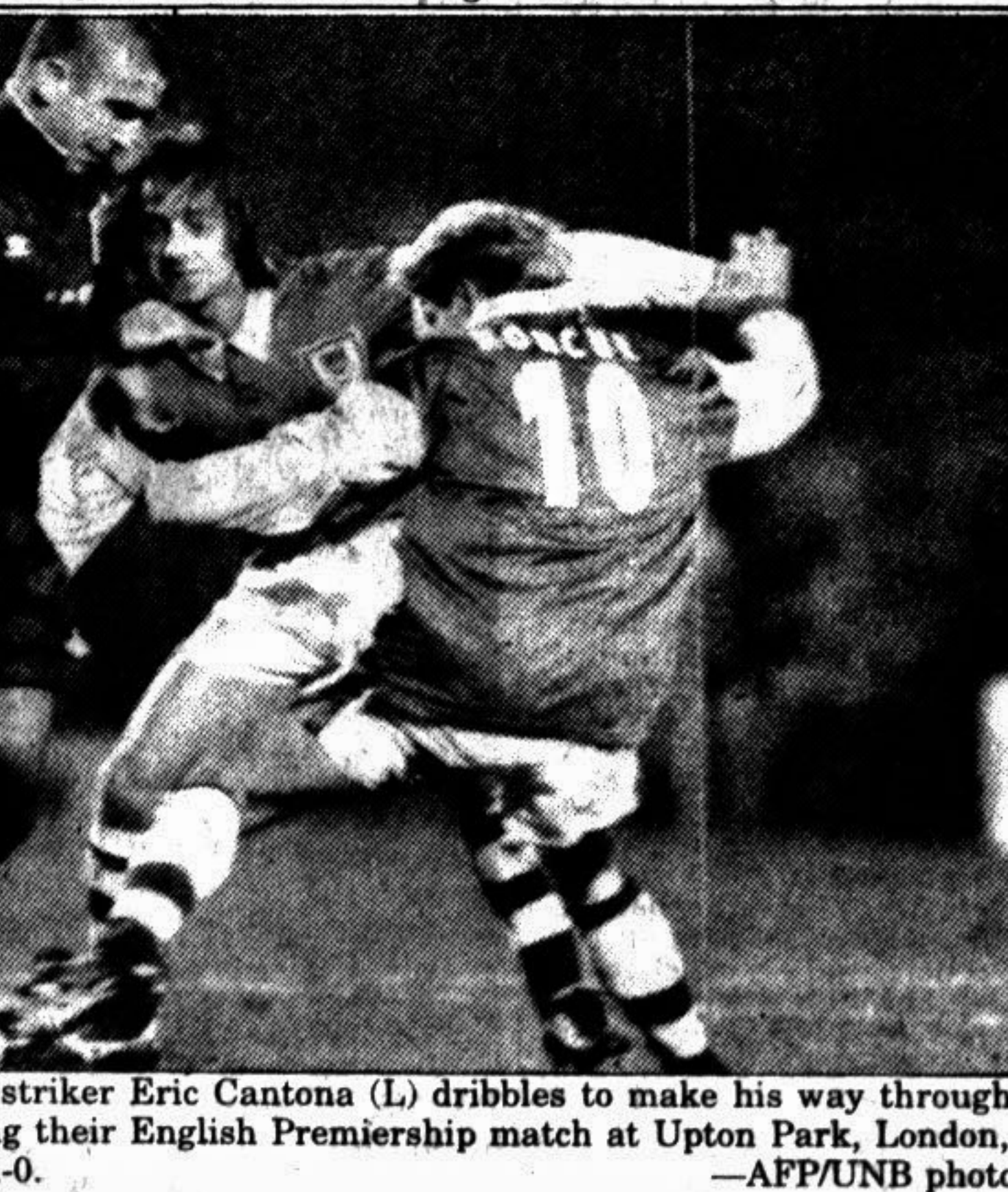
Manchester United's moody striker Eric Cantona (L) dribbles to make his way through the West Ham defence during their English Premiership match at Upton Park, London, on Jan 22. Manchester won 1-0.

Manchester United's moody striker Eric Cantona (L) dribbles to make his way through the West Ham defence during their English Premiership match at Upton Park, London, on Jan 22. Manchester won 1-0.