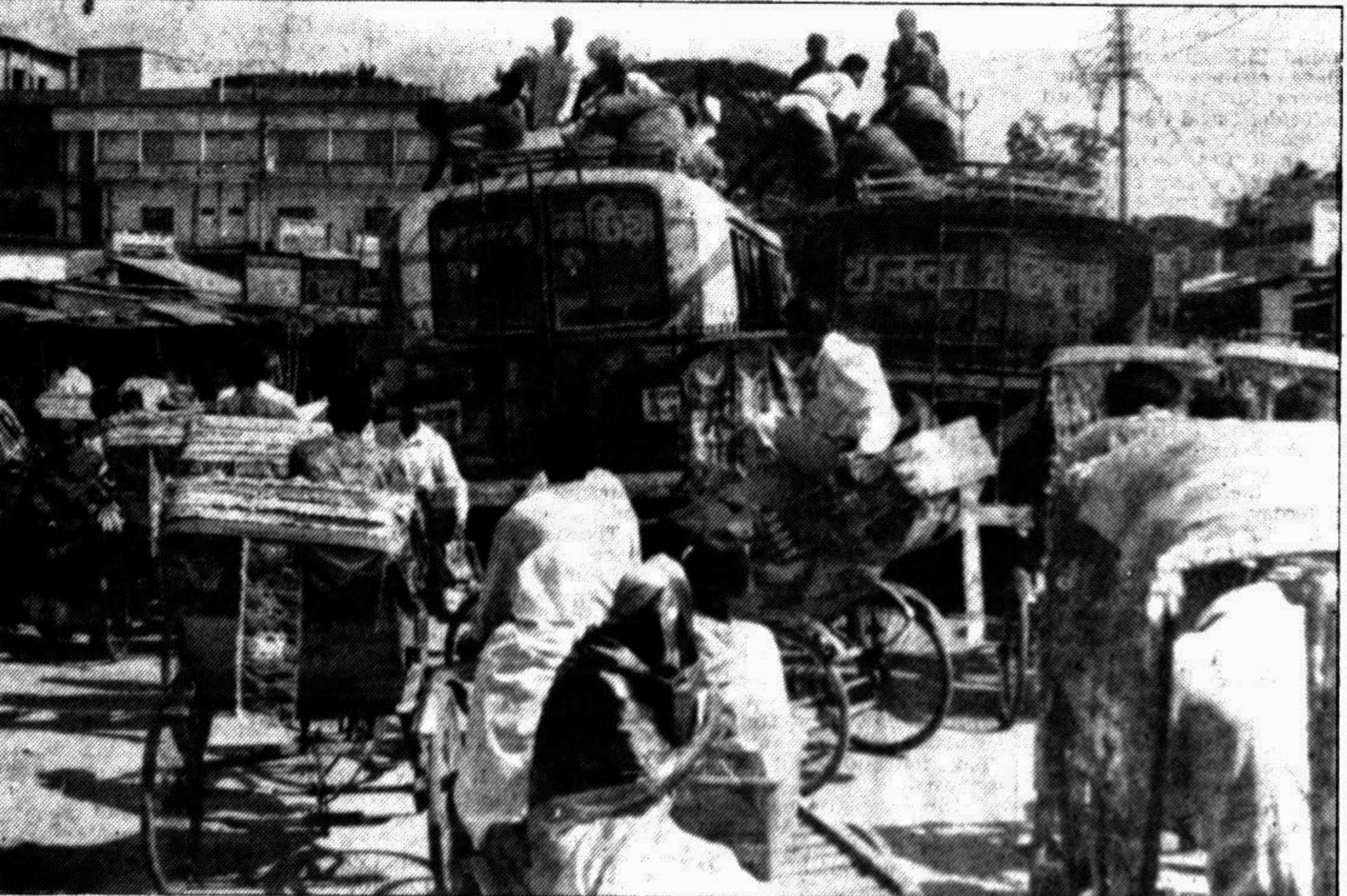
JHENIDAH: A common scene in Jhenidah town. In absence of a bus terminal the interdistrict buses specially from Khulna, Kushtia, Faridpur, Satkhira and few other neighbouring districts make short stoppages to pick up passengers. Consequently the waiting buses create traffic jams seriously disrupting traffic movement in the entire city centre.