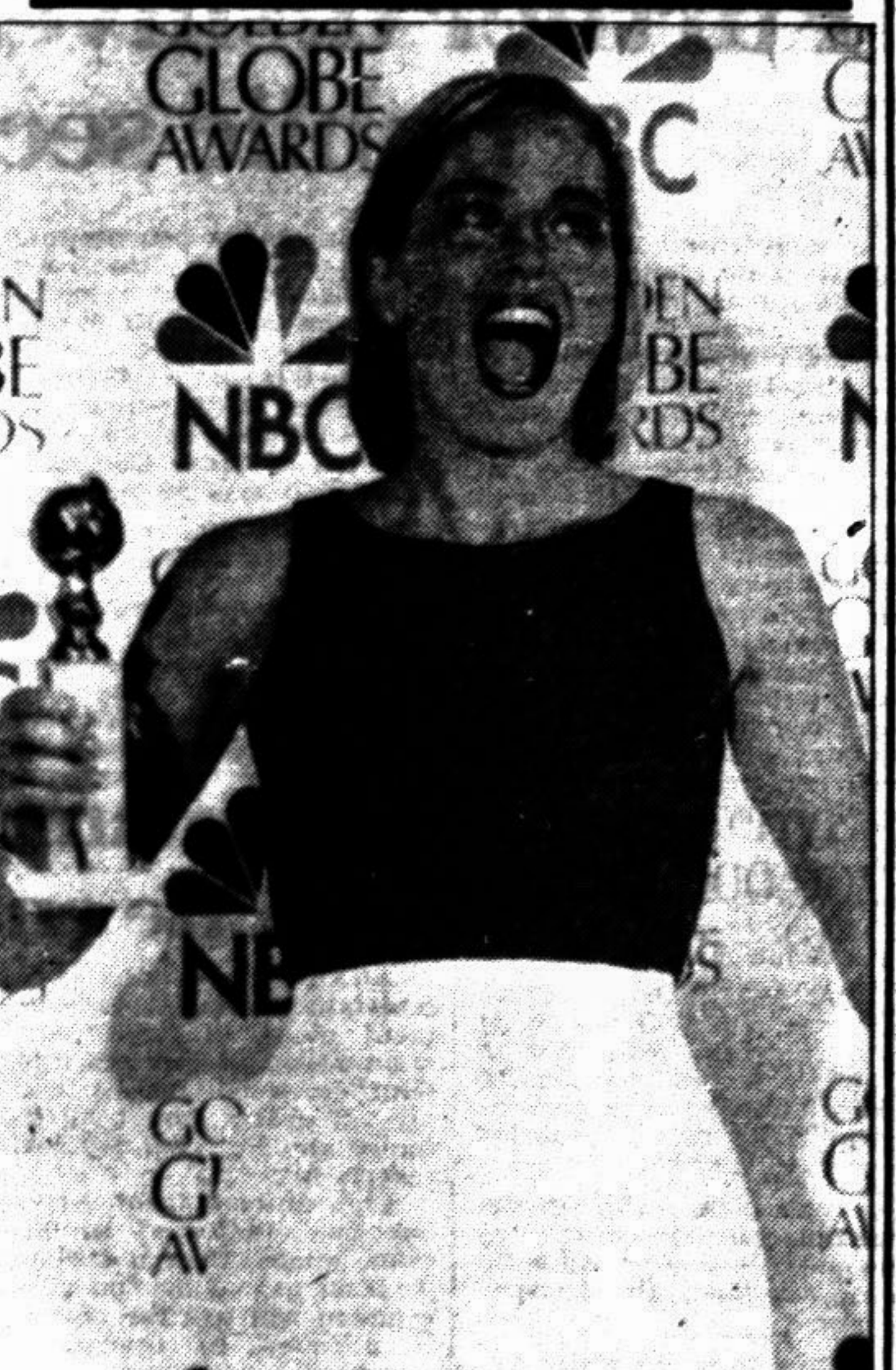
Sharon Stone reacts to winning the Golden Globe Award on Sunday for Best Actress: Motion Picture-Drama for her role in "Casino" at the 53rd annual Golden Awards in Beverly Hills, California.

RIO DE JANEIRO: President Fernando Henrique Cardoso forgot to check with his wife before vetoing legislation that would legalise voluntary sterilisation, reports AP.