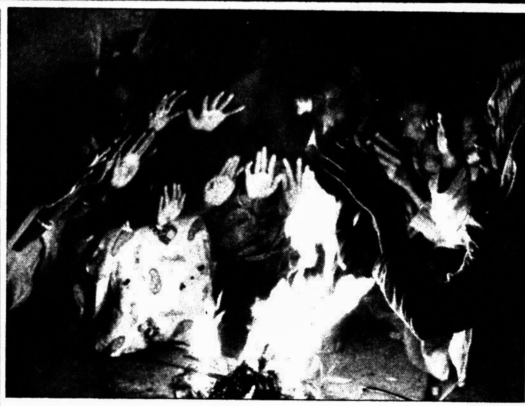
Bid to stave off the bite of cold by the shelterless in the city last night.