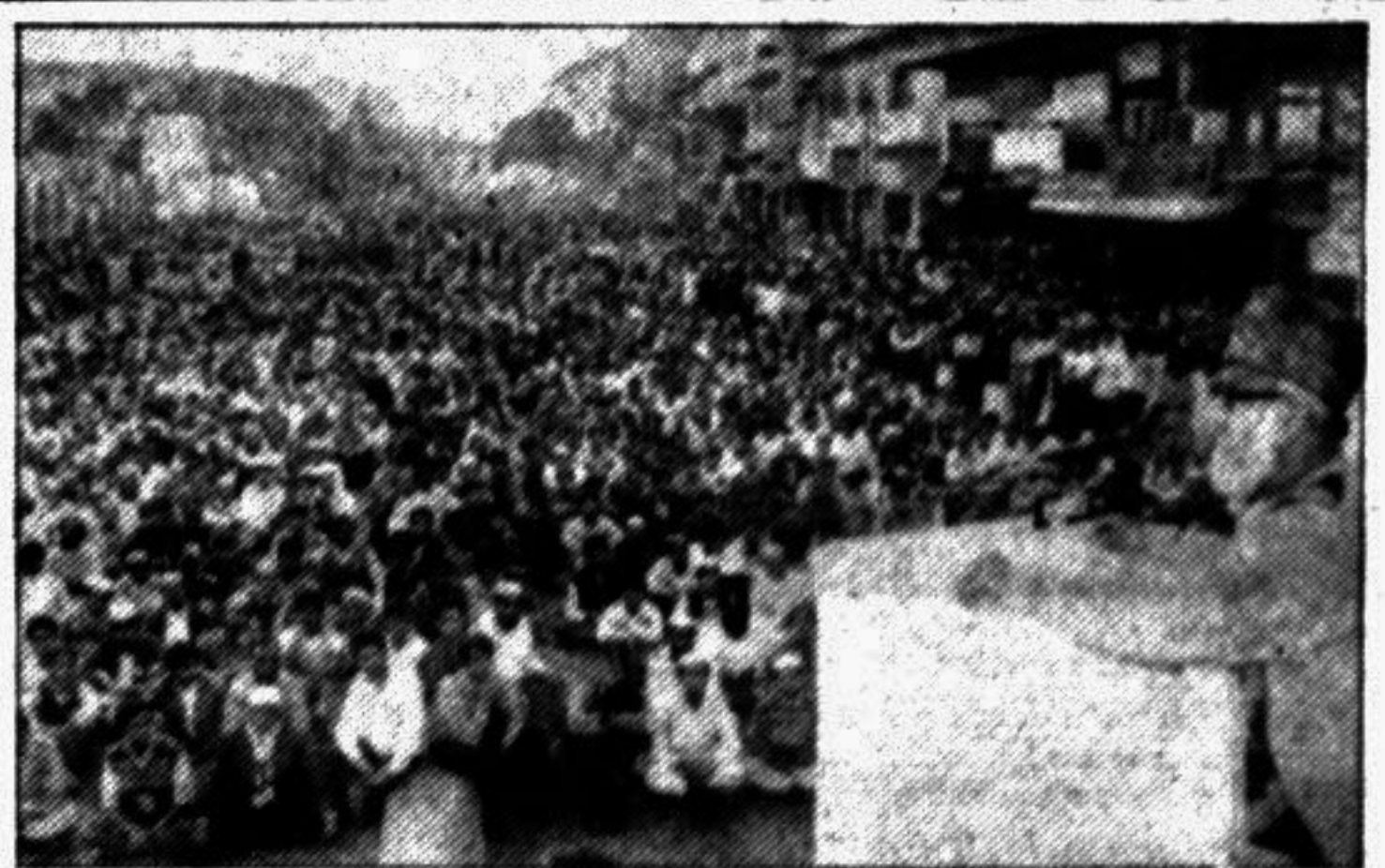
Matiur Rahman Nizami, Secretary-General of Jamaat-e-Islami, Bangladesh addressing a rally in the city yesterday.

Biman Bangladesh Airlines will sponsor first, second and third prizes which include Dhaka-Hong Kong-Dhaka, Dhaka-Karachi-Dhaka, Dhaka-Kathmandu-Dhaka air tickets.