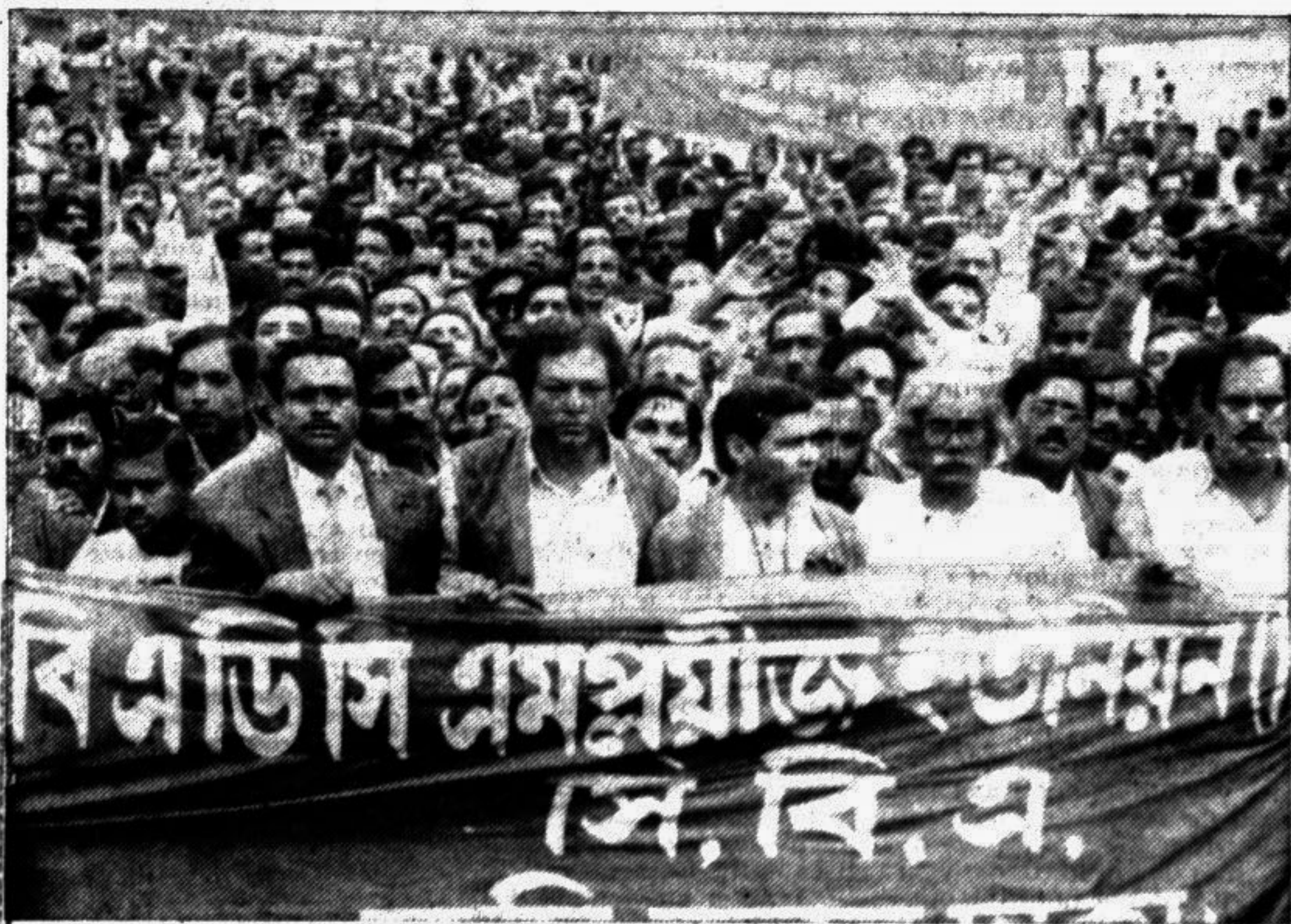
BADC employees union brought out a procession in the city yesterday in realisation of their various demands.