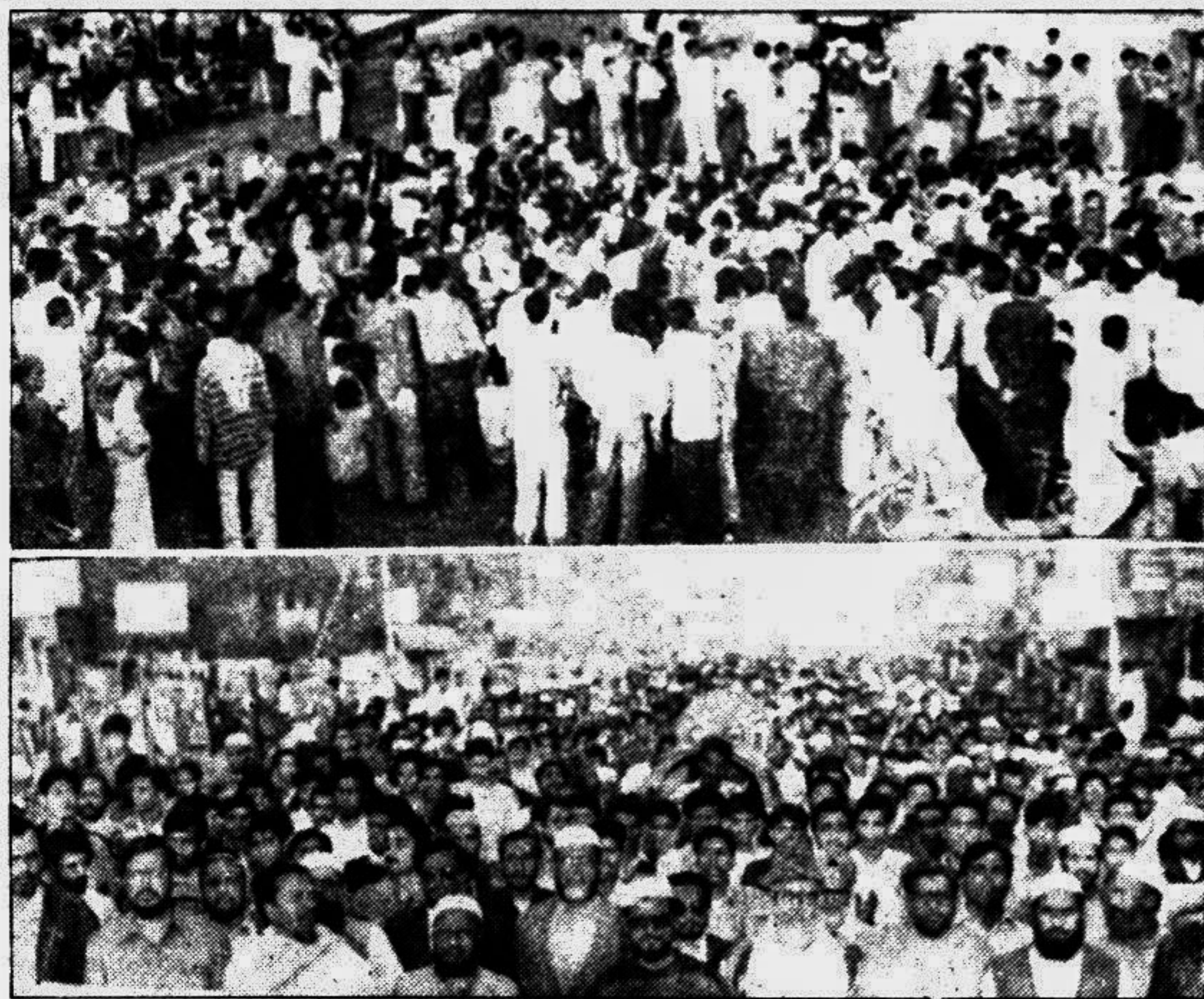
A rally of the Jatiya Party at the Panthapath-Mirpur Road crossing (Top) and a procession of the Jamaat-e-Islami on the Kazi Nazrul Islam Avenue in the city yesterday afternoon.

On Tuesday, the US Ambassador and diplomats of five other developed nations played a go-between in a last-ditch effort for resolving the country's nagging political crisis. But the move apparently failed to yield any results.