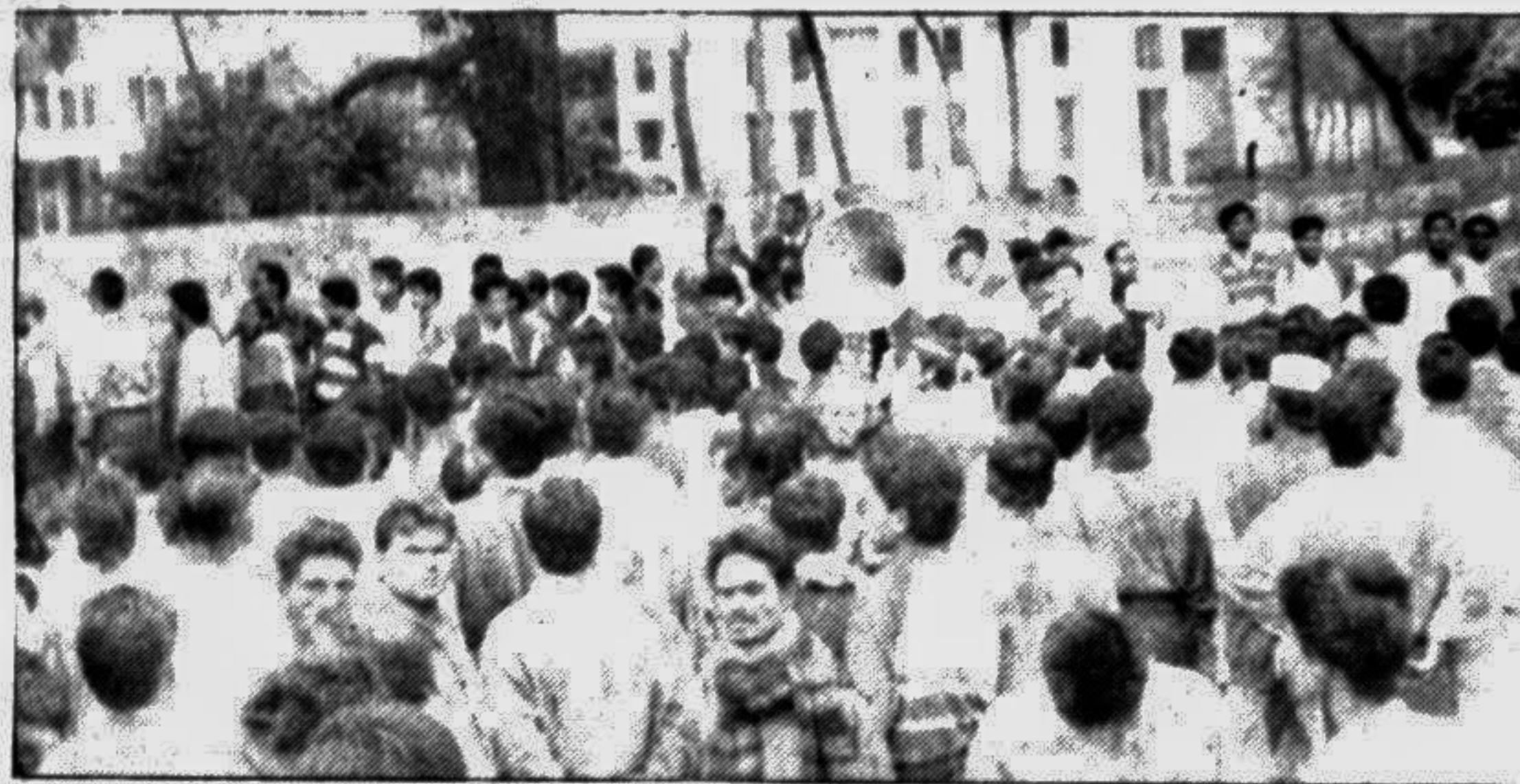
Bangladesh Chhatra League and Islami Chhatra Shibir staged rallies simultaneously in front of the Jatiya Press Club during hartal hours yesterday.

Rangers and officials of the Chittagong Forest Department filed 165 cases and sent 264 people to court.