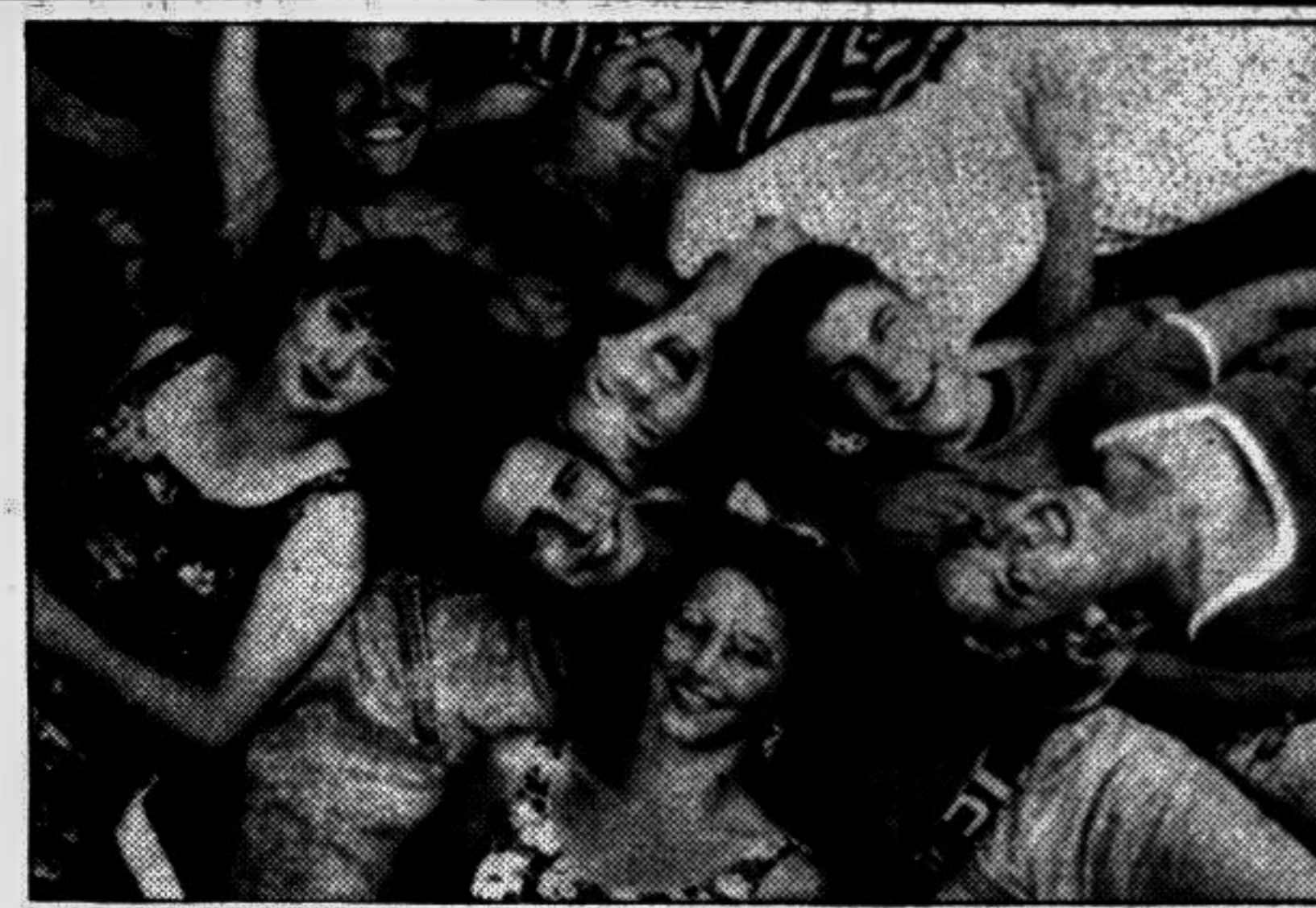
Beverly Hills on Star Plus, Tonight at 12:00

6:00 am Frame By Frame 7:00 Rewind VJ Sophiya 8:00 Jump