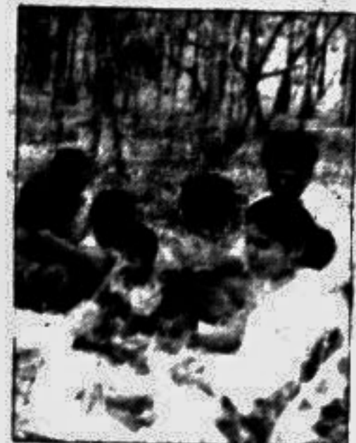
Merry Season of Picnics Page 3