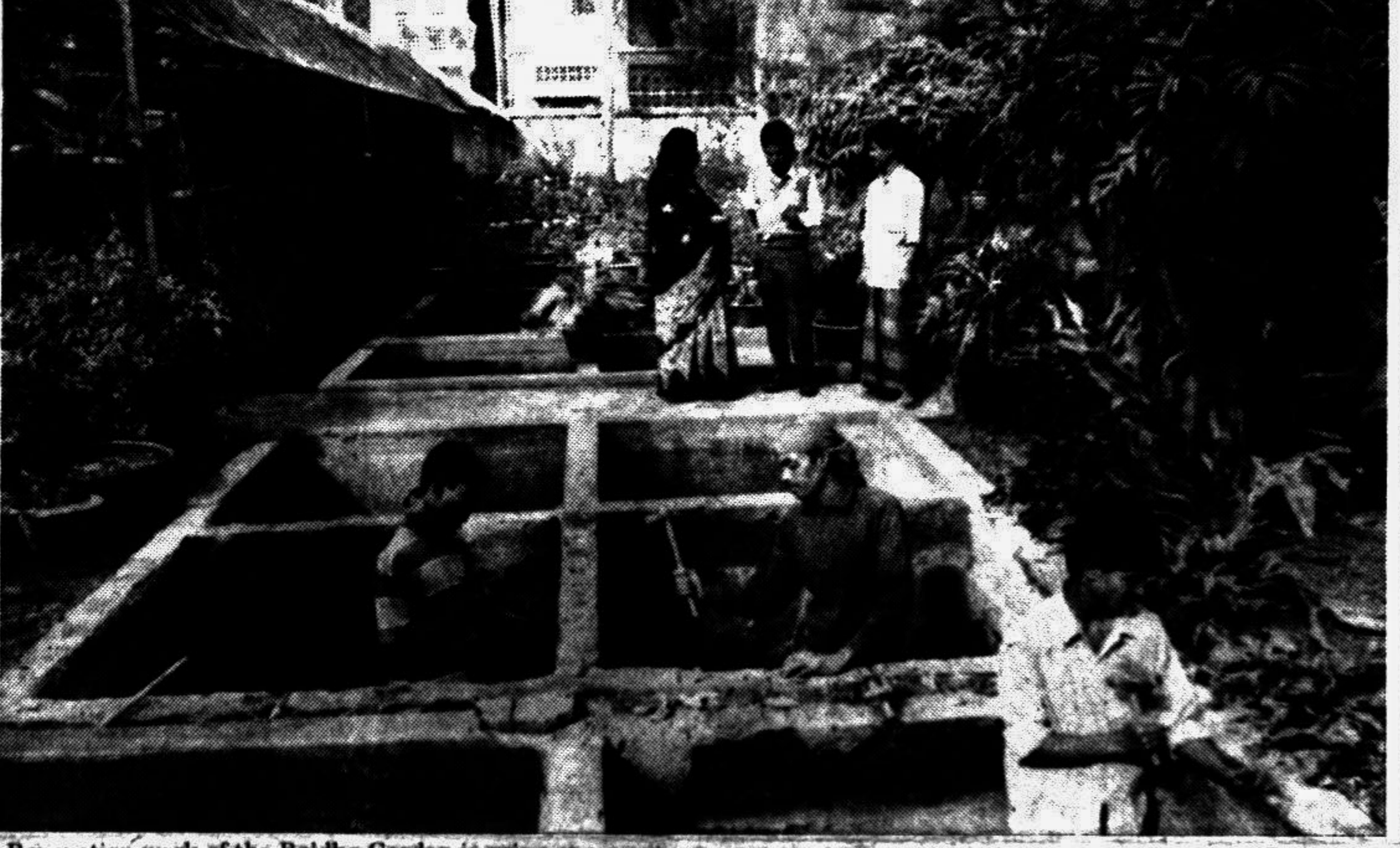
Renovation work of the Baldha Garden is going on.