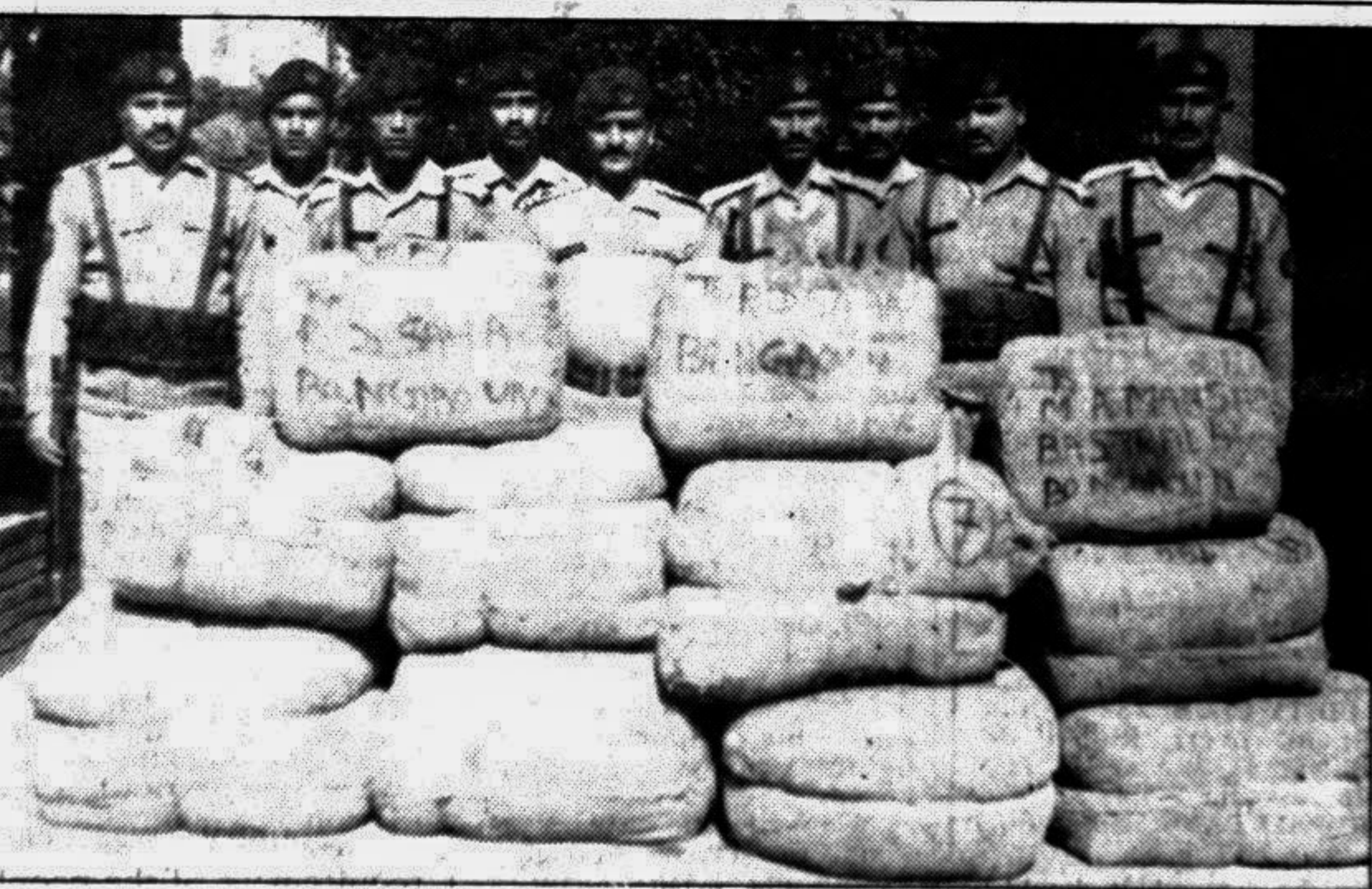
JESSORE: Seized smuggled Indian goods at a local BDR camp. The contrabands were recently seized while being smuggled into the country.