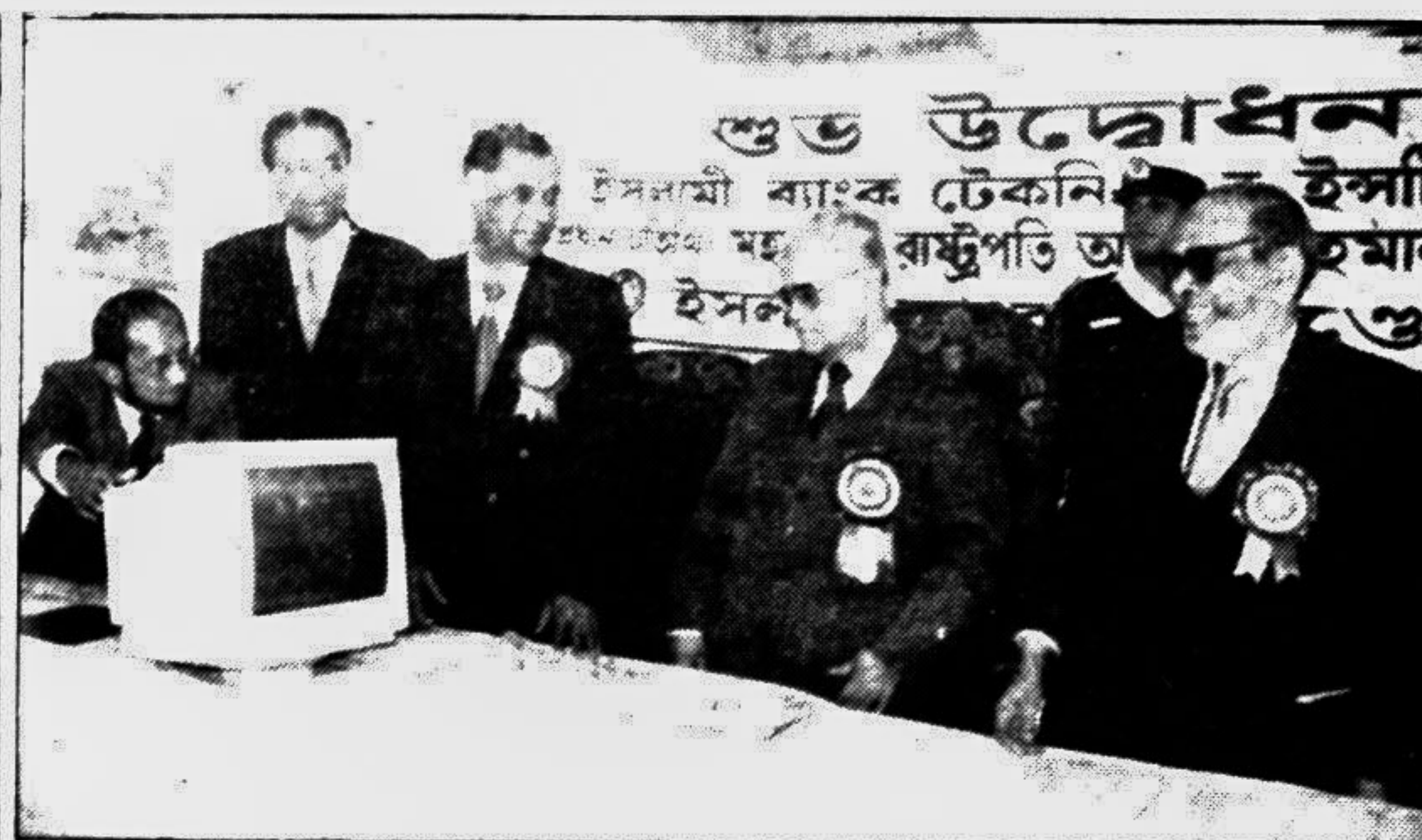
President Abdur Rahman Biswas inaugurated Islami Bank Technical Institute at Purana Paltan Line in the city yesterday by pressing computer button.

All the fertilizer factories are now in full operation. Six urea fertilizer factories produced 10,60,240 MT during the first six months of current financial year as against 10,04,997mt during the corresponding period of last year indicating an increase of 55,243 mt.