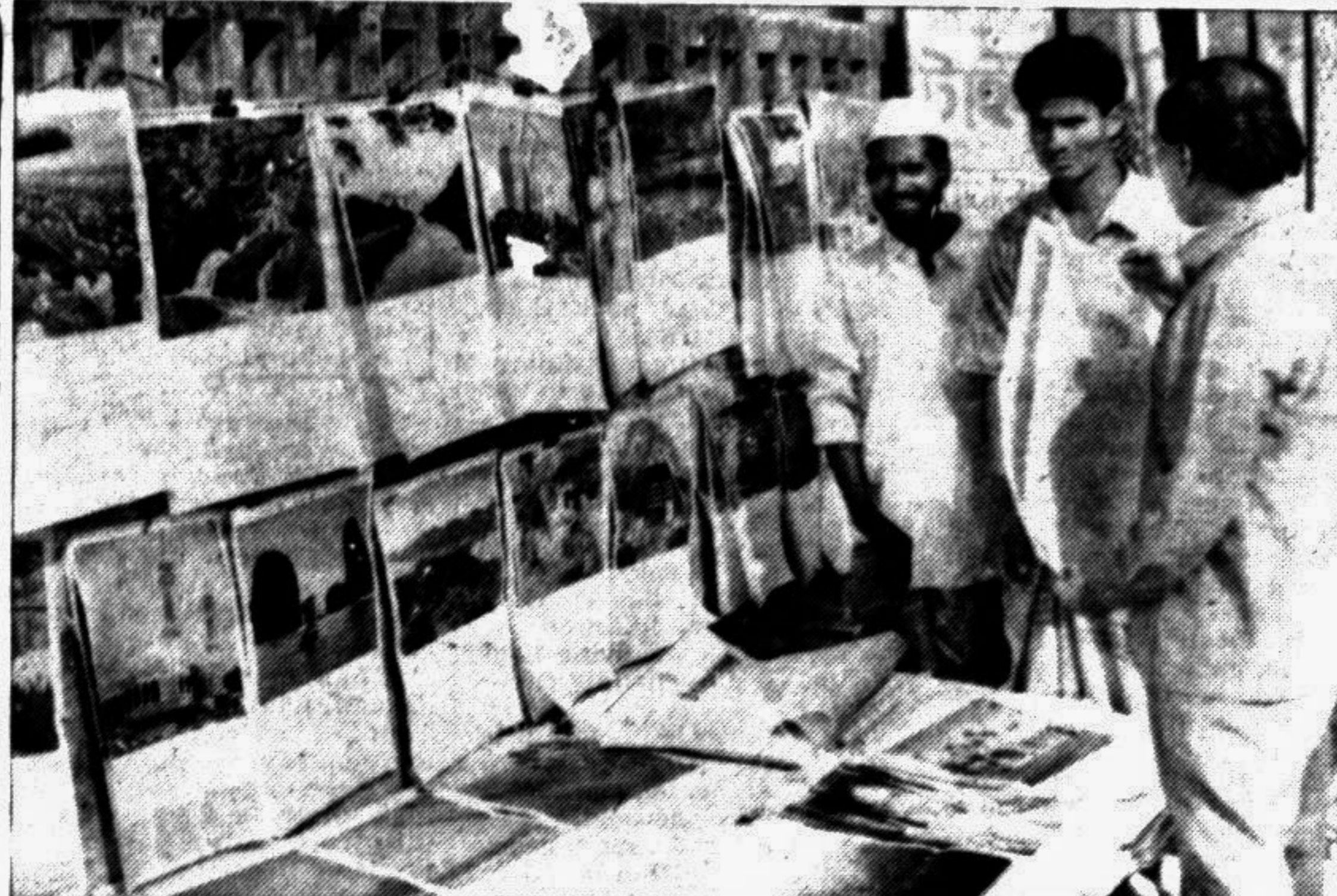
Street vendors doing a brisk business in the city selling calendars for 1996.

[This article is a follow-up to the news item "Six teenage girls rescued, 5 arrested" published on 1 December 1995 in the Daily Star. It is the result of an Ahn O Salish Kendra investigation by Mr Tpu Sultan.]