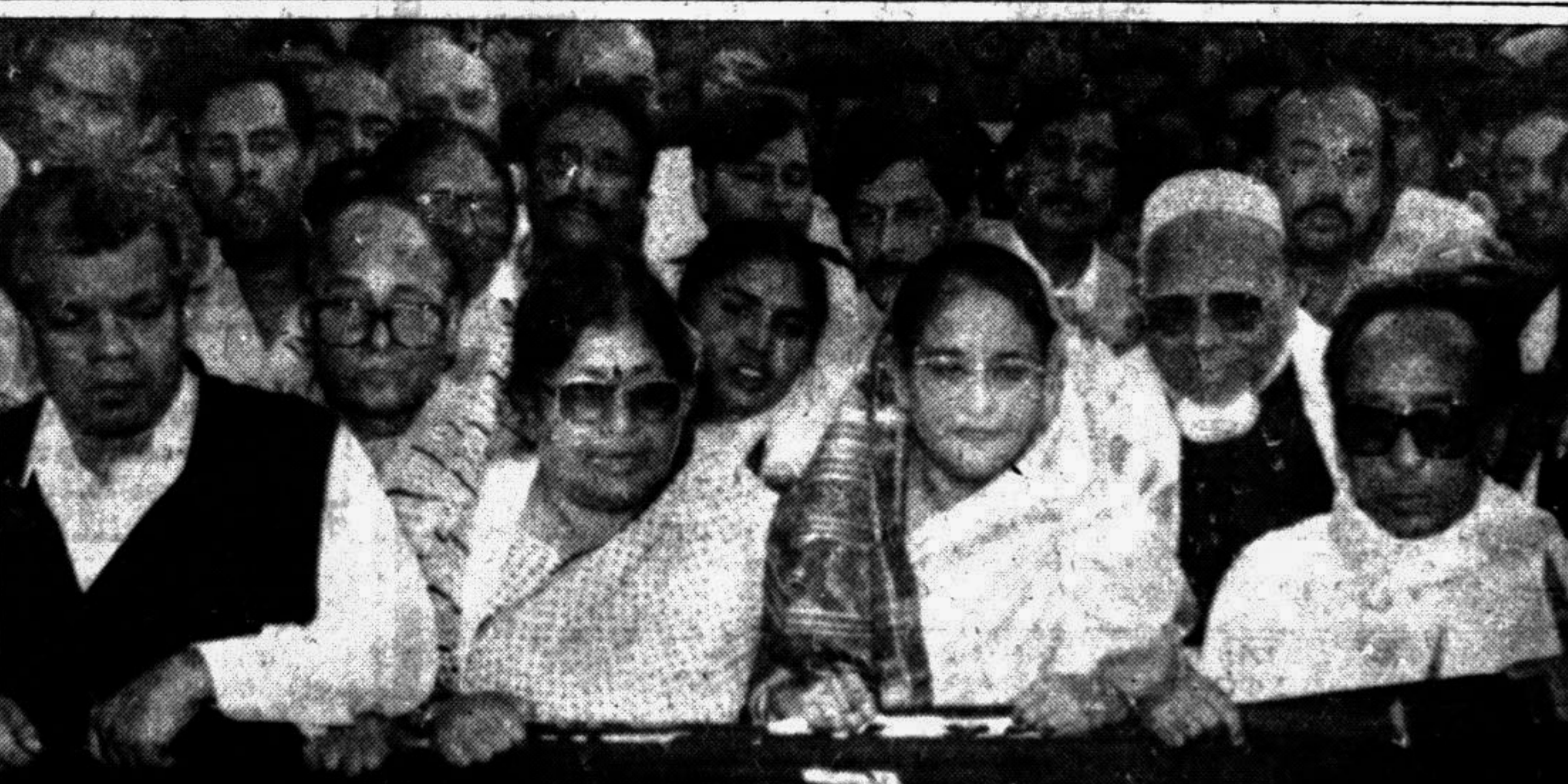
Awami League chief Sheikh Hasina leading a street march yesterday in the city demanding resignation of the Prime Minister for holding polls under a caretaker government.