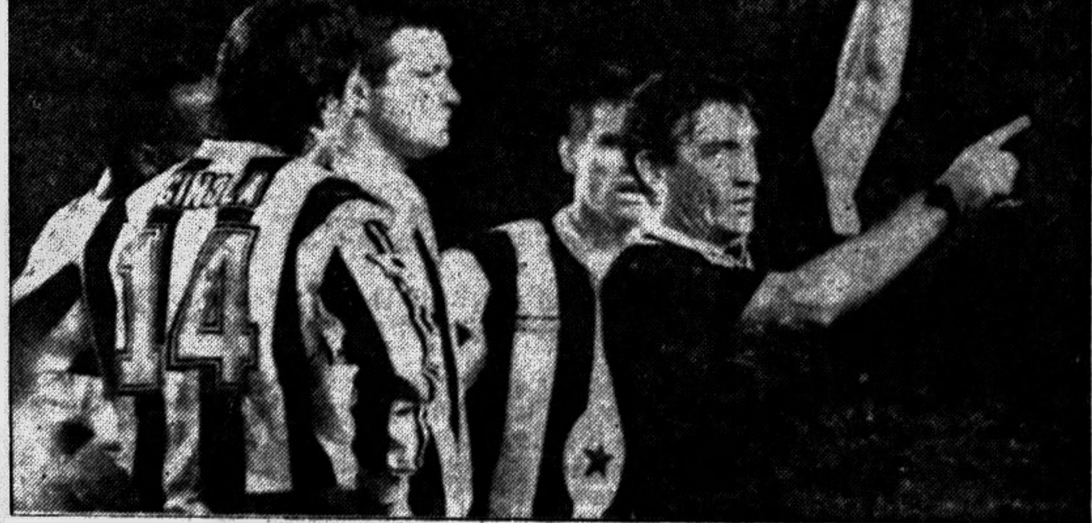
AND OUT YOU GO... Newcastle's French star David Ginola (14) is given marching orders by the referee after being adjudged to have elbowed Arsenal defender Lee Dixon during a Coca-Cola Cup quarter final tie at Highbury on January 10. The sending-off resulted in a touchline confrontation between Arsenal manager Bruce Rioch and Newcastle assistant manager Jerry McDermott.