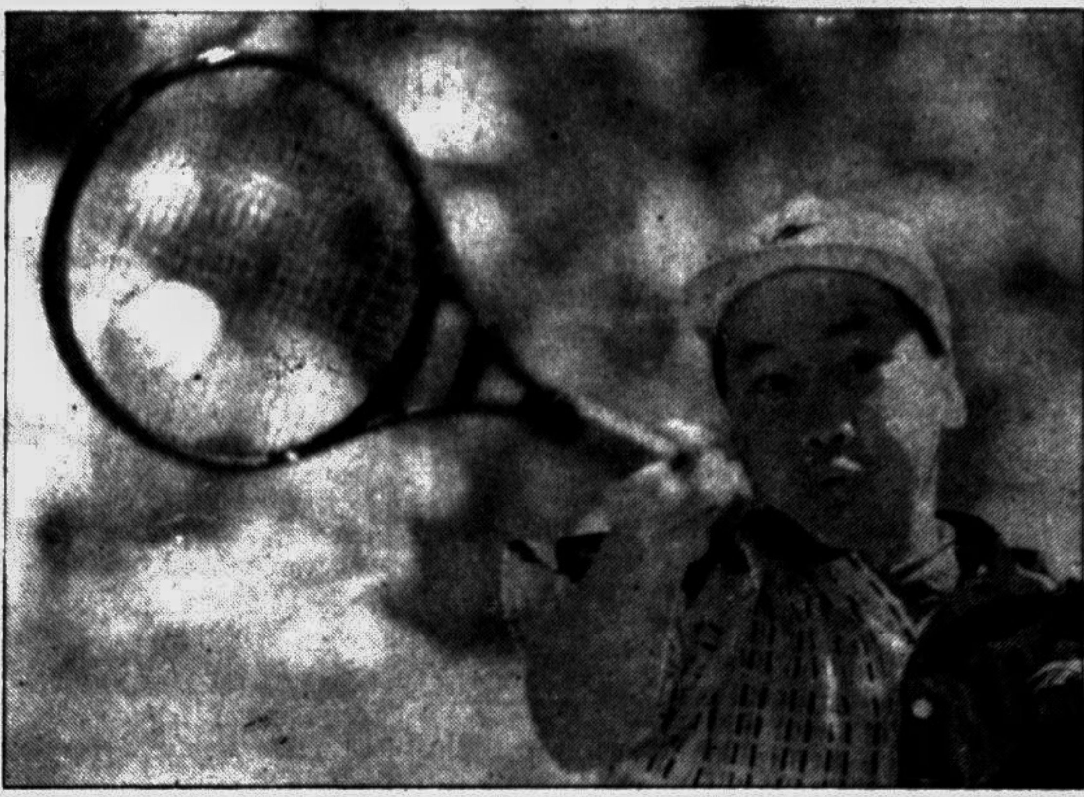
American Michael Chang fires a blistering forehand against compatriot Jim Courier in a Colonial Classic exhibition game at Kooyong, Melbourne on January 11. Chang romped past Courier 6-4, 6-0.

Atlanta was also the most dangerous city in last year's survey and many of this year's worst were among the bottom 10 last year.