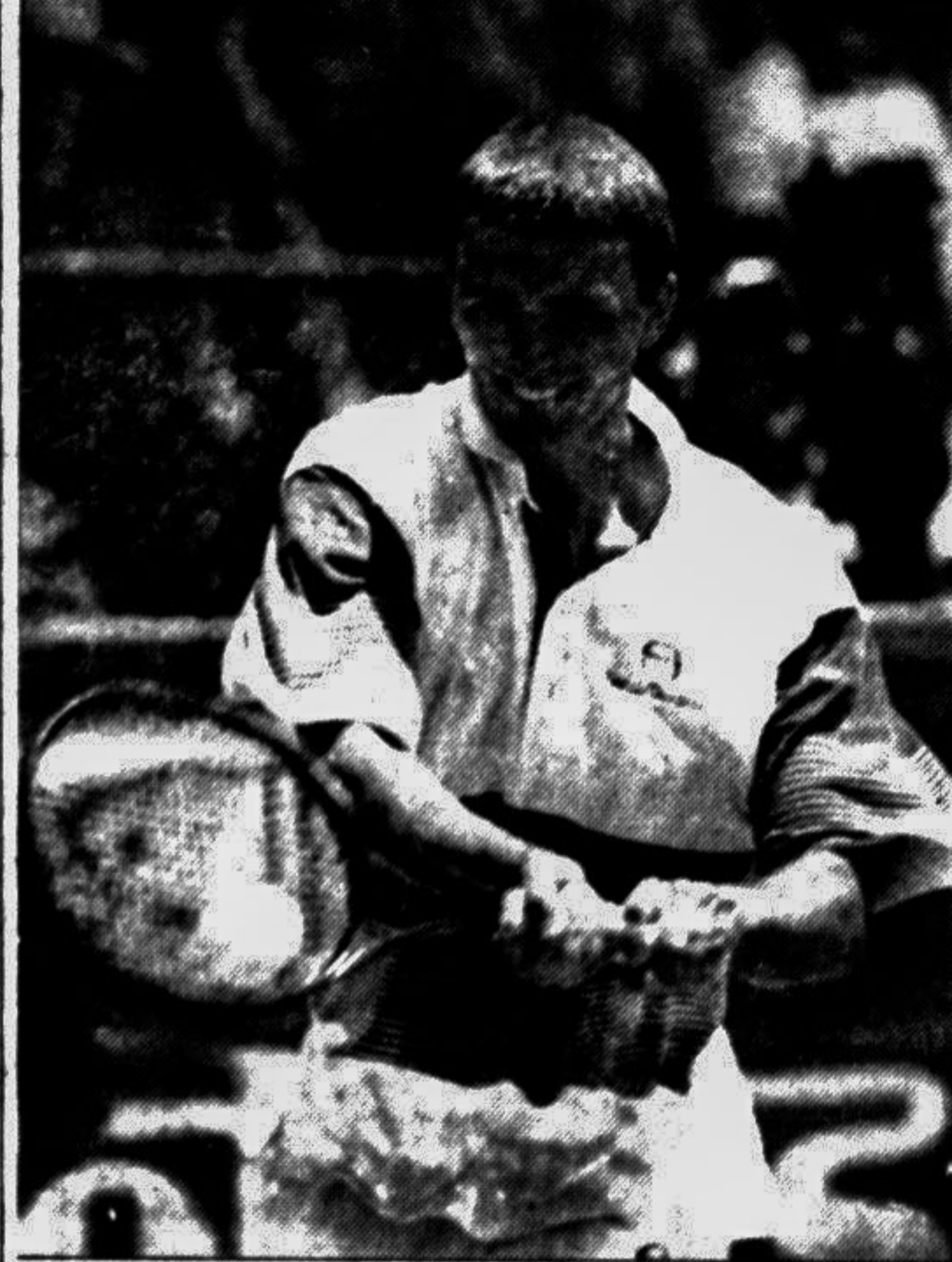
Hot-headed Croat Goran Ivanisevic is a study of concentration as he hits a double-handed backhand on his way to the finals of the Sydney International on January 12. Ivanisevic defeated Australia's Todd Woodbridge 6-3, 7-6.