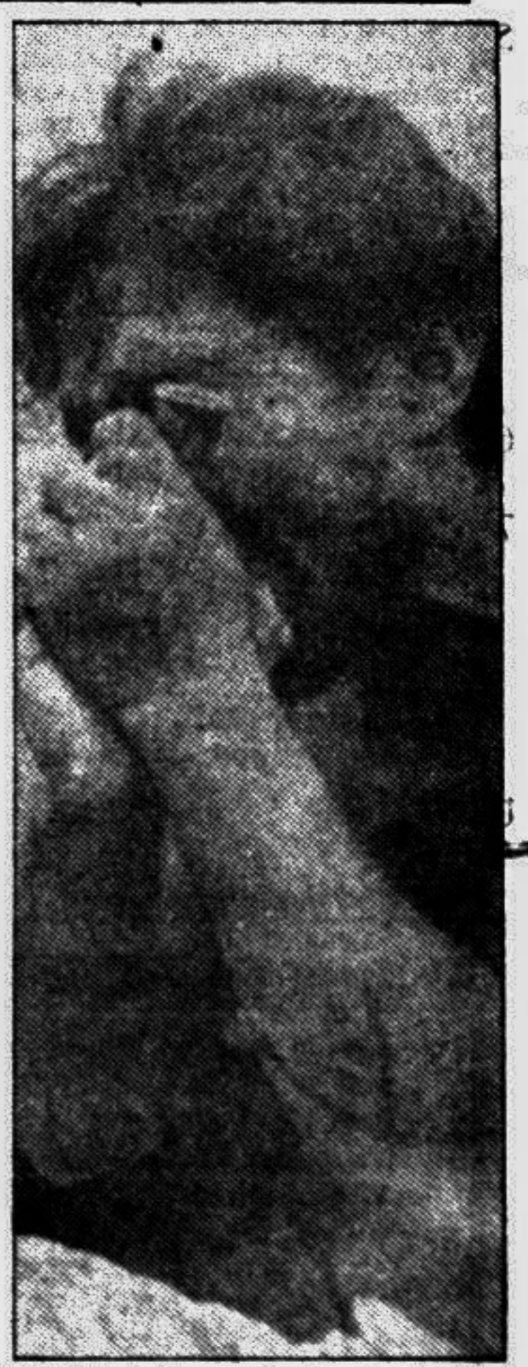
IN-H-A-L-E... And get choked as the fashion design of the youth has increased so much. We have to take steps for destroying this circle of intoxicants at once, otherwise it will be too late for us to save our nation. I don't want to see such a catastrophe; do you?

in the trap of Phensidyle, influenced by some of his friends. Then he threw light on the reason behind rejecting Phensidyle: "By taking Phensidyle boys or girls never go drunk. They get only little bit hallucinated and that's why the sleep goes deeper and deeper."