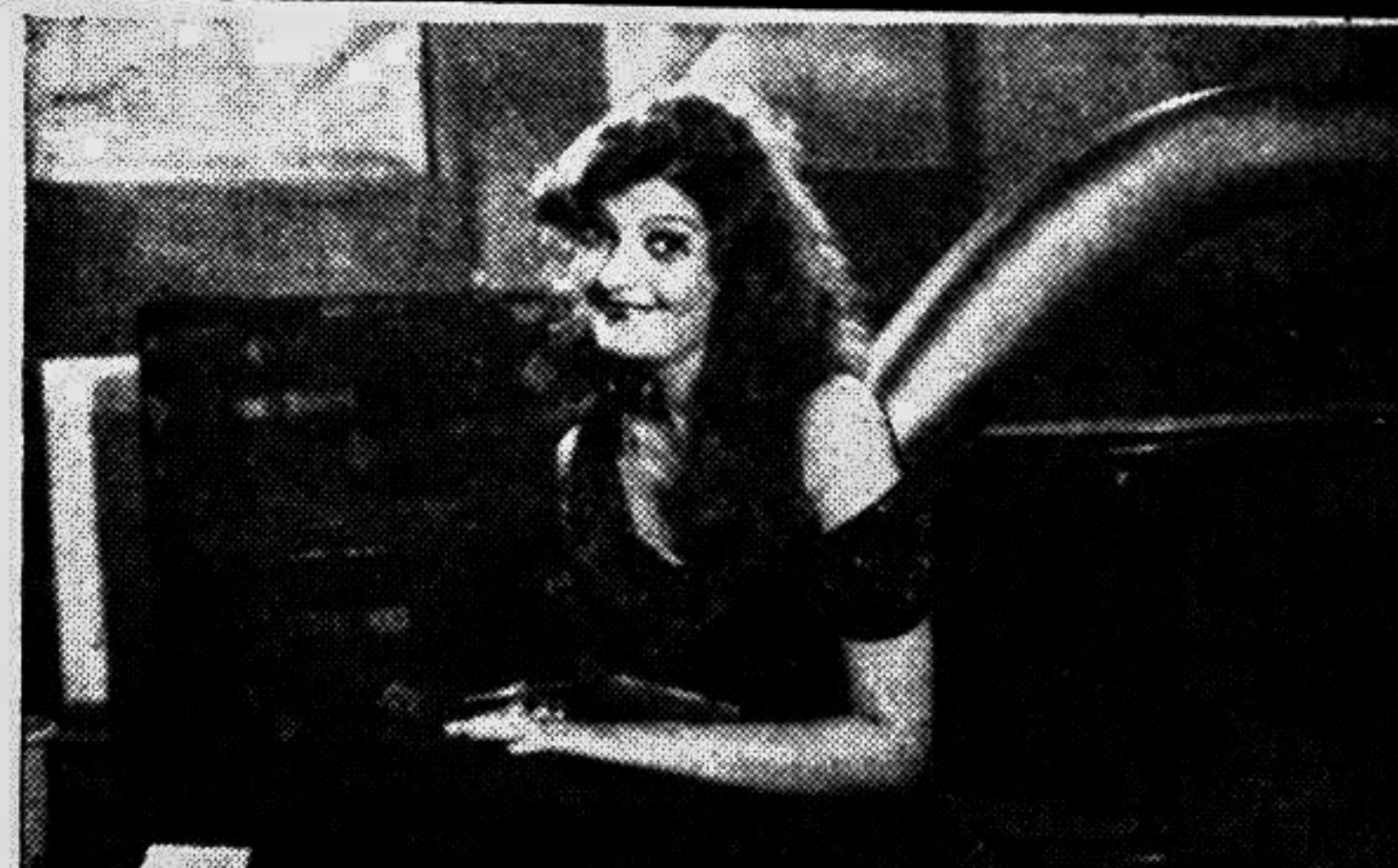
Sonu Walia in Yaadon Ke Rang, Tonight on Zee TV

7:00am Asian Top 20 VJ News 9:00 The Vibe Weekend VJ Live