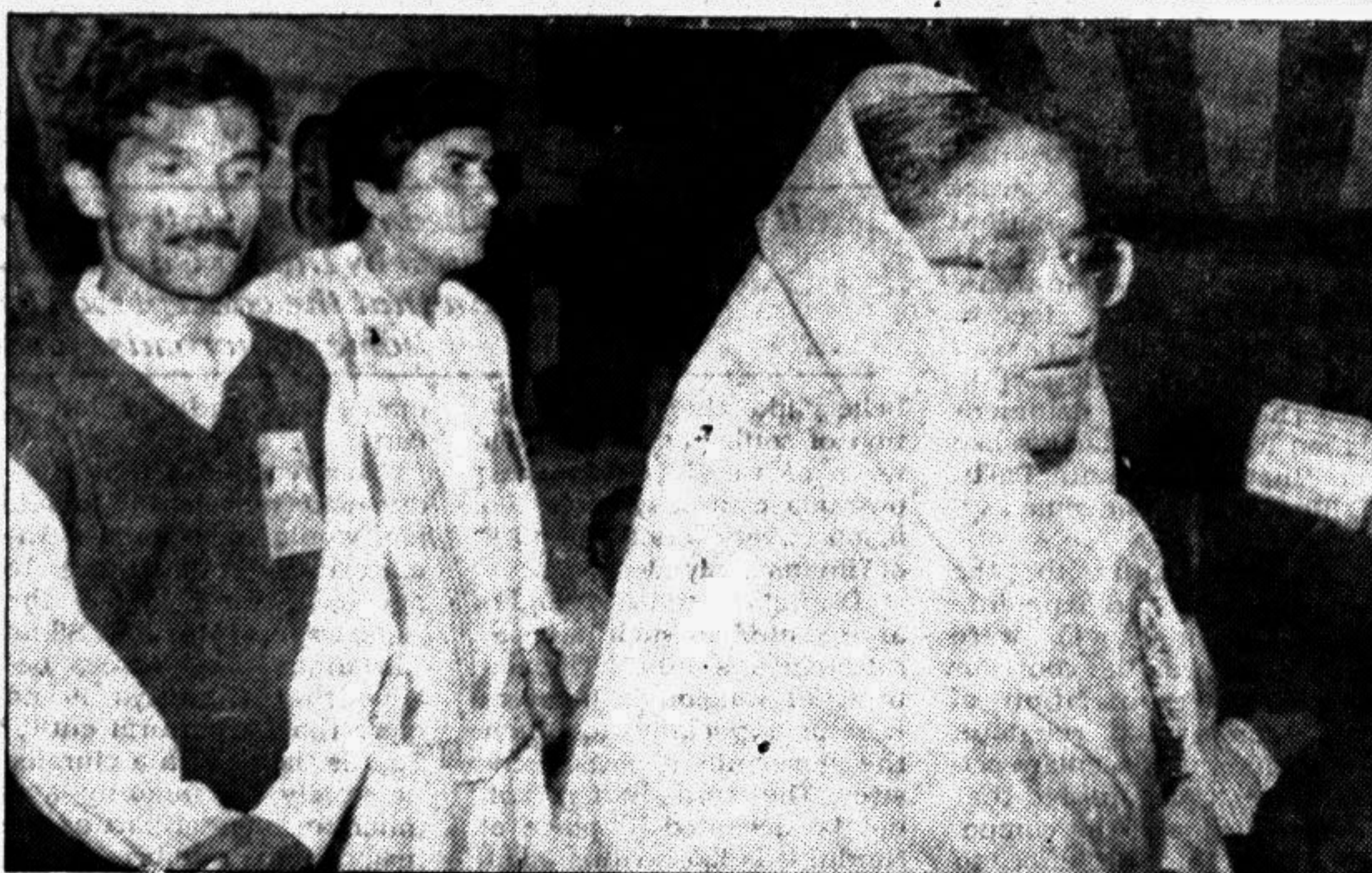
Awami League president Sheikh Hasina speaking at a reunion arranged in connection with the 48th founding anniversary of Bangladesh Chhatra League (S-P), in the city yesterday.