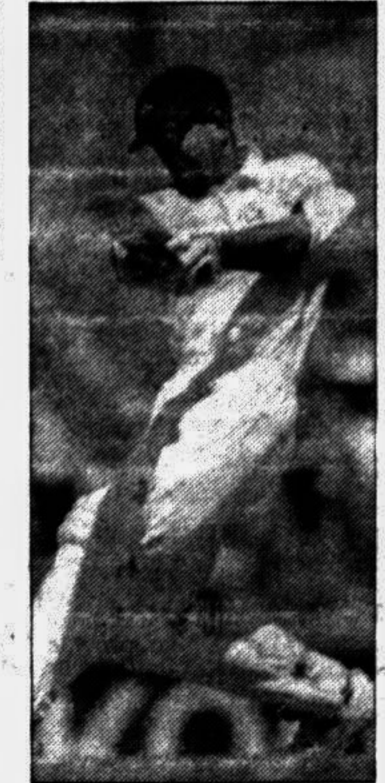
PONTING ... 123 Kaluwitharana Match result: Sri Lanka won by three wickets.

the game for Muralitharan. "I would like to dedicate this game to Muralitharan, who has been a great team man. The guys decided they would do it for him and they pulled it off," De Silva said. "Overall, we played with much more aggression in this particular game," he added. Australia selectors later dropped opener Michael Slater for their next match against the same opponents in Perth on Friday. After failing in his last five innings in the competition, Slater will be replaced by all-rounder Steve Waugh, who has recovered from a hamstring strain. There's not much point playing Michael if he is not making runs. It will not do his confidence any good. Overall, we're a bit off the boil at the moment," Australia