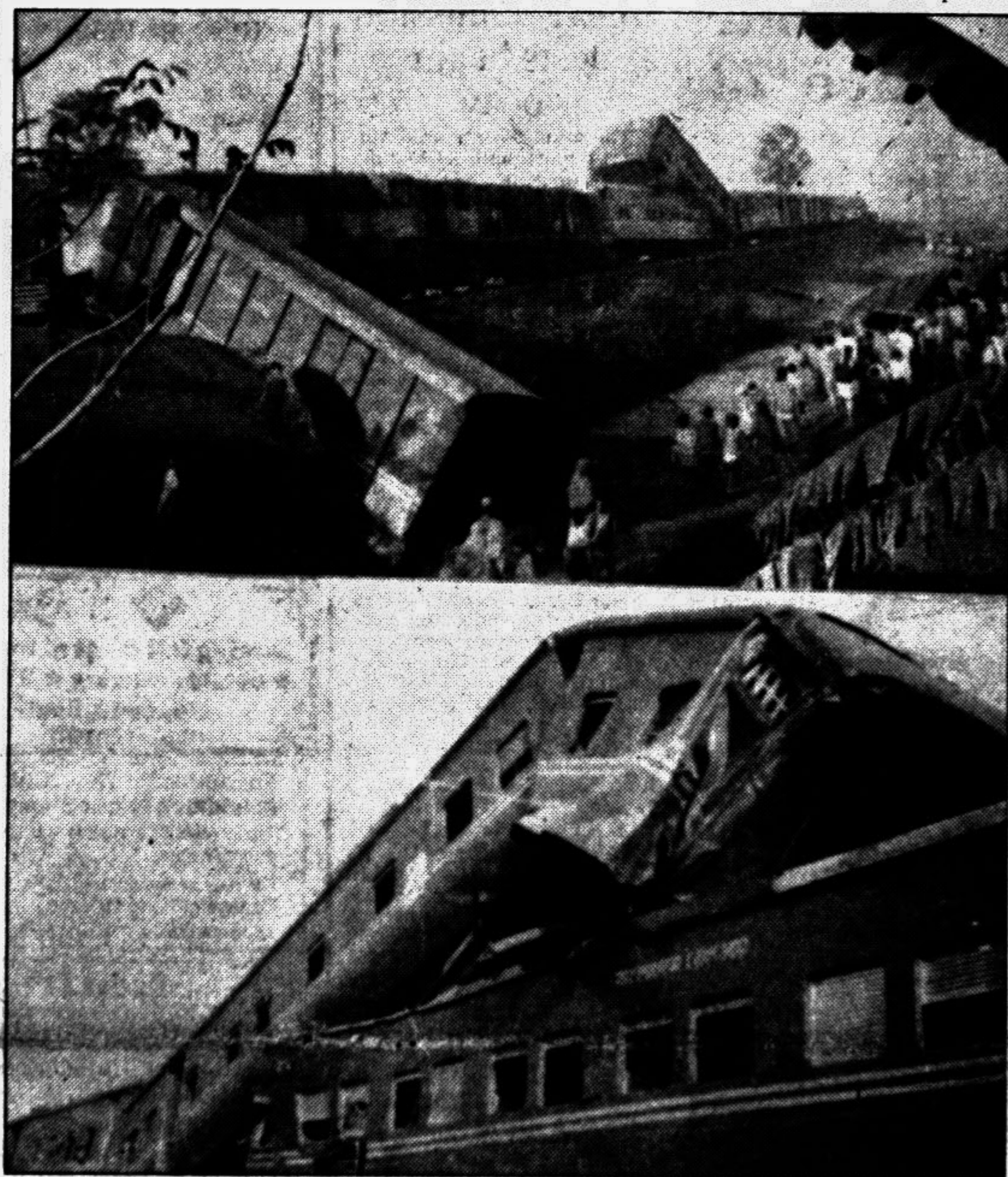
Some bogies skidded off the track (Top) and one bogie slid over another (Bottom) in the head-on collision between two trains near Hajiganj in Chandpur Monday.

The Chandpur-Laksham line is likely to be re-opened today after the salvage operators remove the wreckage from the track.