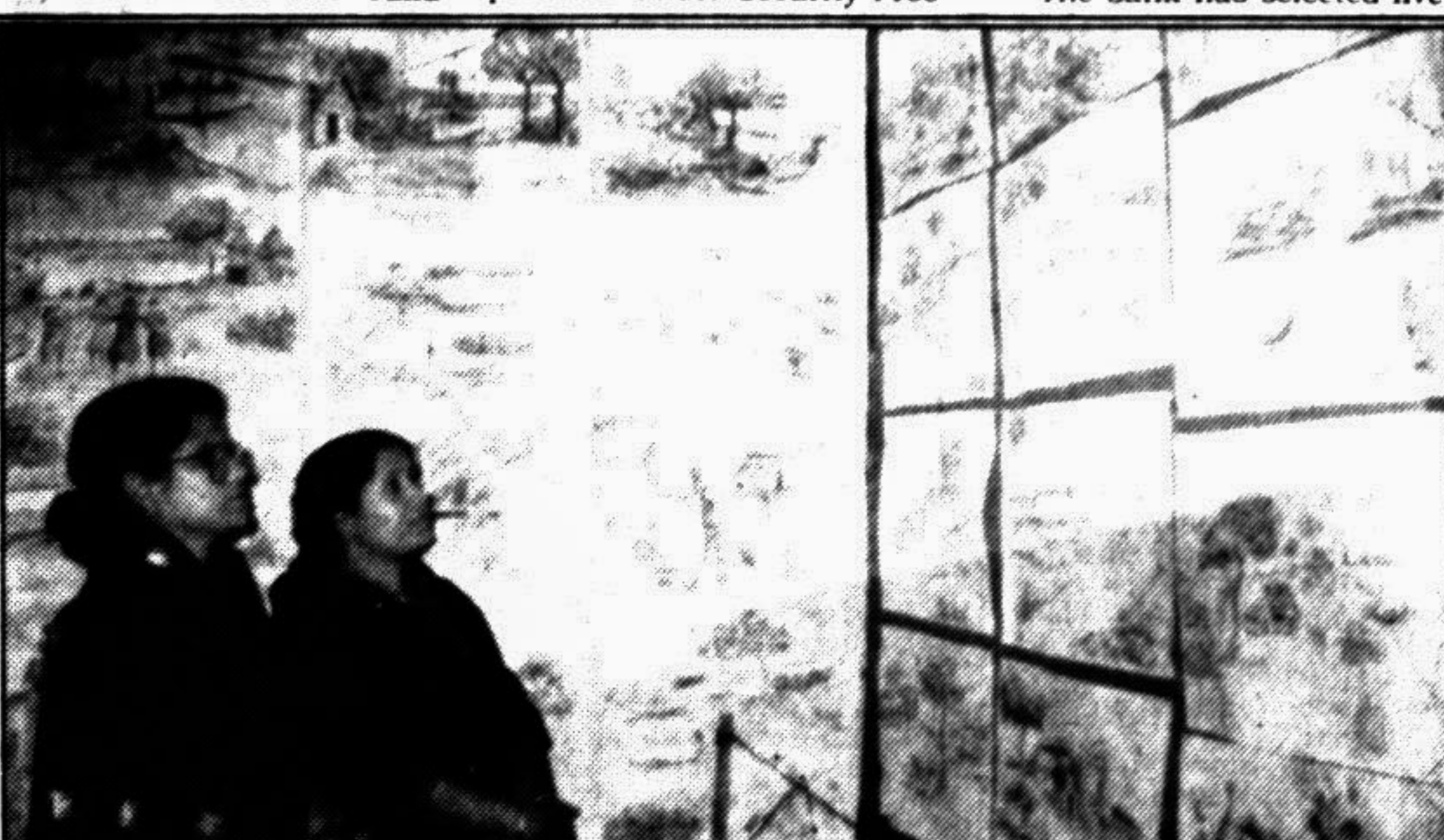
BRAHMANBARIA: Visitors at the recent Painting Exhibition organised by Brahmanbaria Shishu Nattom at local Shilpakala Academy.