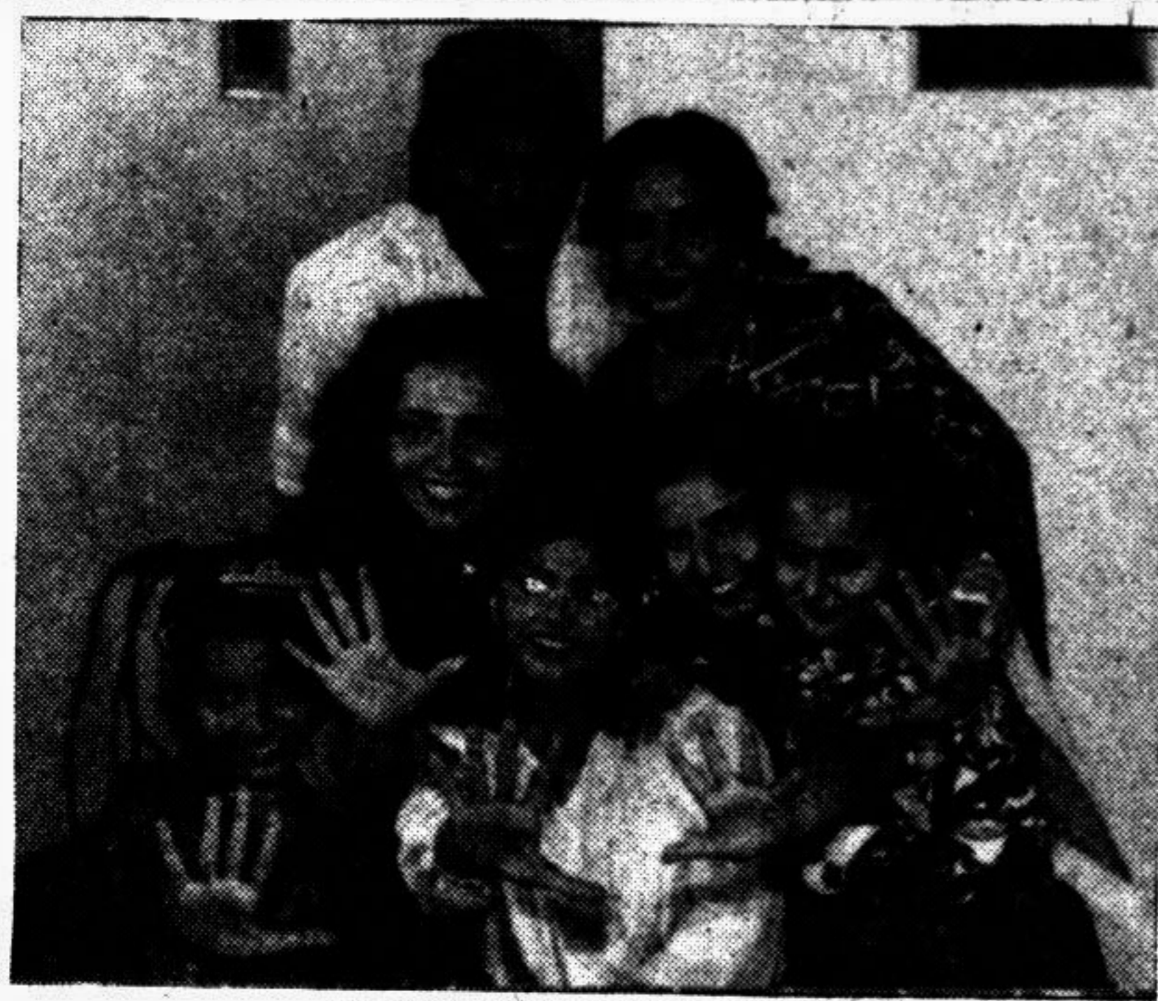
Hum Panch on Zee TV, Tonight at 8:30

6:00am BBC World News inc. Asia Today 6:25 Newsnight 7:00 BBC World News inc. Asia Today 7:25 World Business Report 8:00 BBC World News inc. Asia Today 8:25 Newsnight 9:00 BBC World News inc. Asia