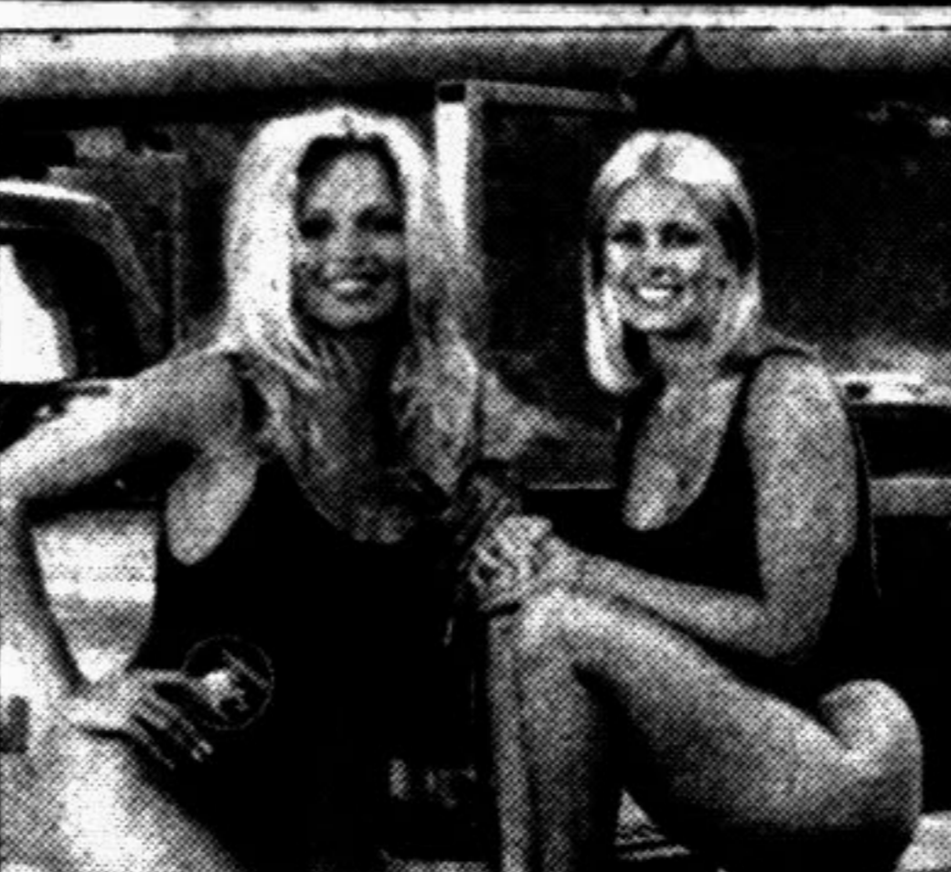
Baywatch on Star Plus, Tonight at 12:30

6:30am Infotainment (TMM) 6:30 Devotional Songs 7:00 Jagran 7:30 A to Z: The Management Programme 8:00 Naya A To Z 8:30 A To Z: Networking 9:00 Jan Gan Man 9:30 Singer Tumhara Liye 10:30 Yo Namaste 11:00 Namaste India 11:30 Khana Khazana 12:00 Celeste 12:30 Insight 1:00 A