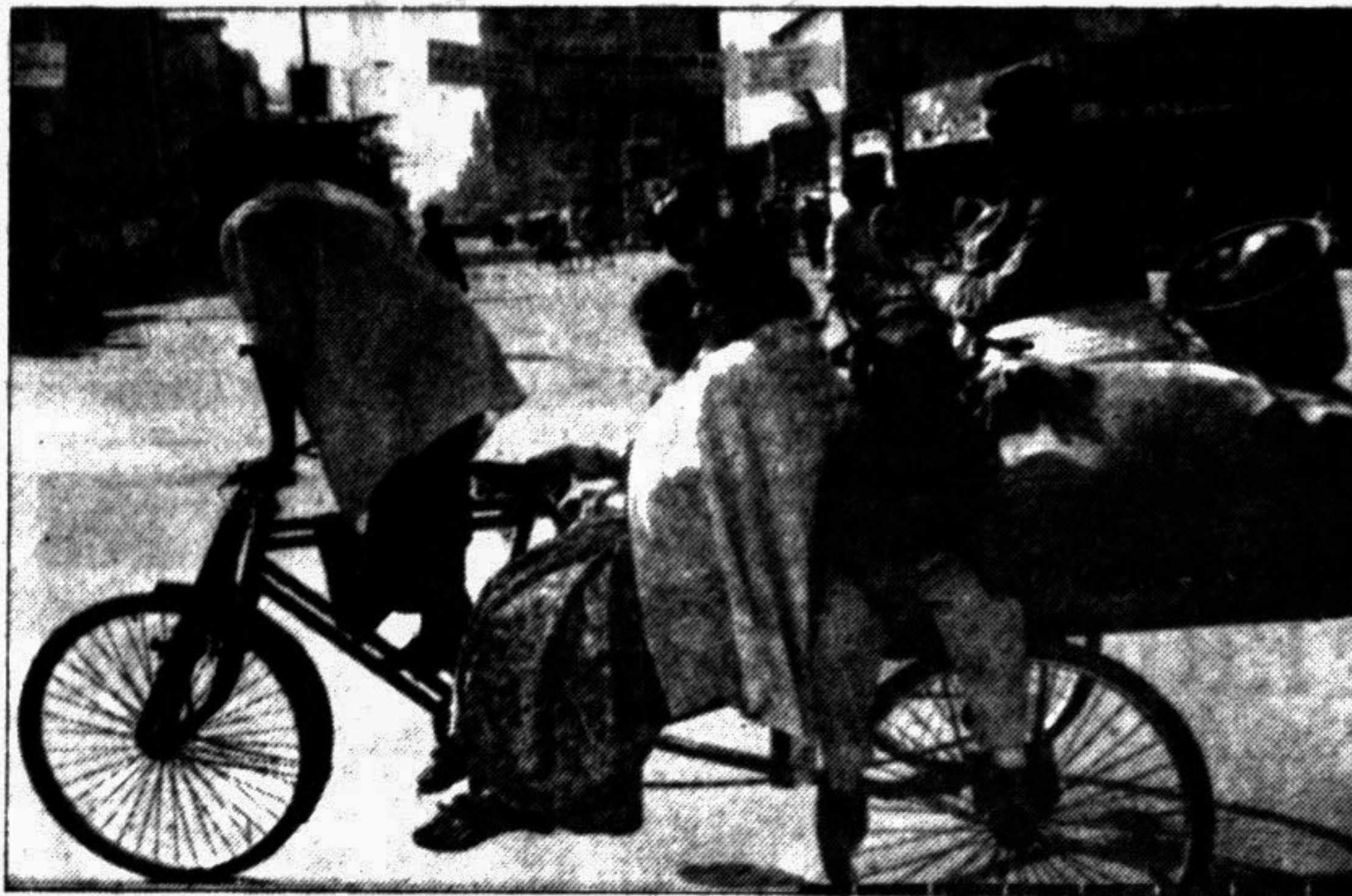
This family undertakes a risky ride during hartal hours yesterday.