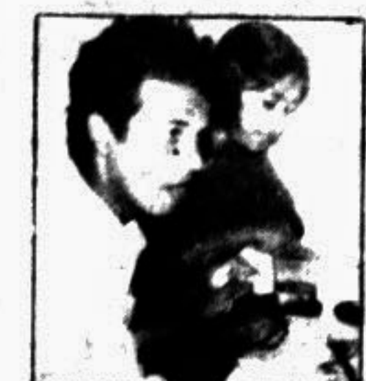
Lure of Gourmet Restaurants Page 3