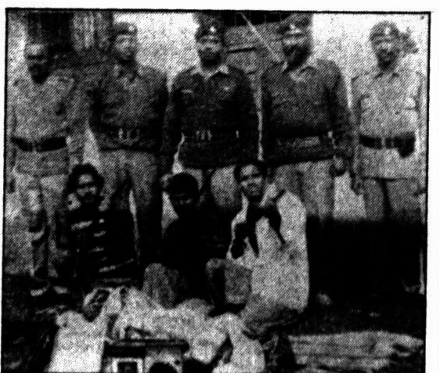
SATKHIRA: Satkhira thana police recently arrested three dacoits and recovered arms, ammunitions and booties from their possession.

On the other hand, fax machines have been installed at many thana headquarters, whereas no fax device has been installed at the public call office at the district headquarters of Gopalganj, causing extreme sufferings of journalists, businessmen and other fax users alike.