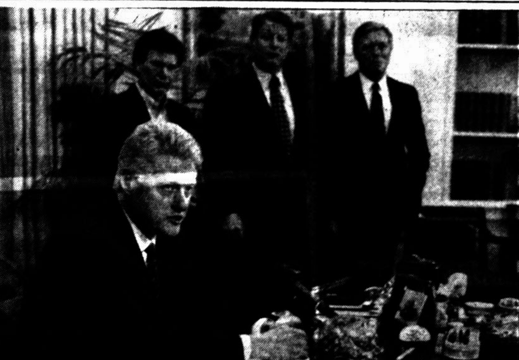
US President Bill Clinton speaks to reporters in the White House's Oval Office Saturday after signing the continuing resolution to reopen all government services through January 26.

NEW DELHI, Jan 7: India's next parliamentary elections will be held in April, Prime Minister PV Narasimha Rao announced yesterday, report AFP, Reuters. "Elections would definitely be held in April this year," the Press Trust of India (PTI) quoted Rao as telling reporters in the central Indian city of Bhopal. It was the first firm announcement about the elections, due this year. A government spokesman also quoted Rao as saying that general polls would be held in April. Senior government officials said the polls were likely to be held in the first half of the month. Rao has said for sometime the favoured elections just one or two months before the end of the government's five-year term in office in June, and he has repeatedly indicated he would opt for an April vote. Opposition parties have been pressing for an earlier vote, either in February or March. Rao said there were no differences between his Congress (I) Party government and the autonomous Election Commission over the holding of the polls to the 545-house parliament. The Election Commission is expected to make a formal announcement about the elections in February or March, Rao, 74, became Prime Minister after the Congress finished on top in the last hustings held in May-June 1991. The upcoming polls are widely expected to result in a hung parliament, with the main opposition Bharatiya Janata Party (Indian People's Party) determined to provide a stiff fight to the Congress.