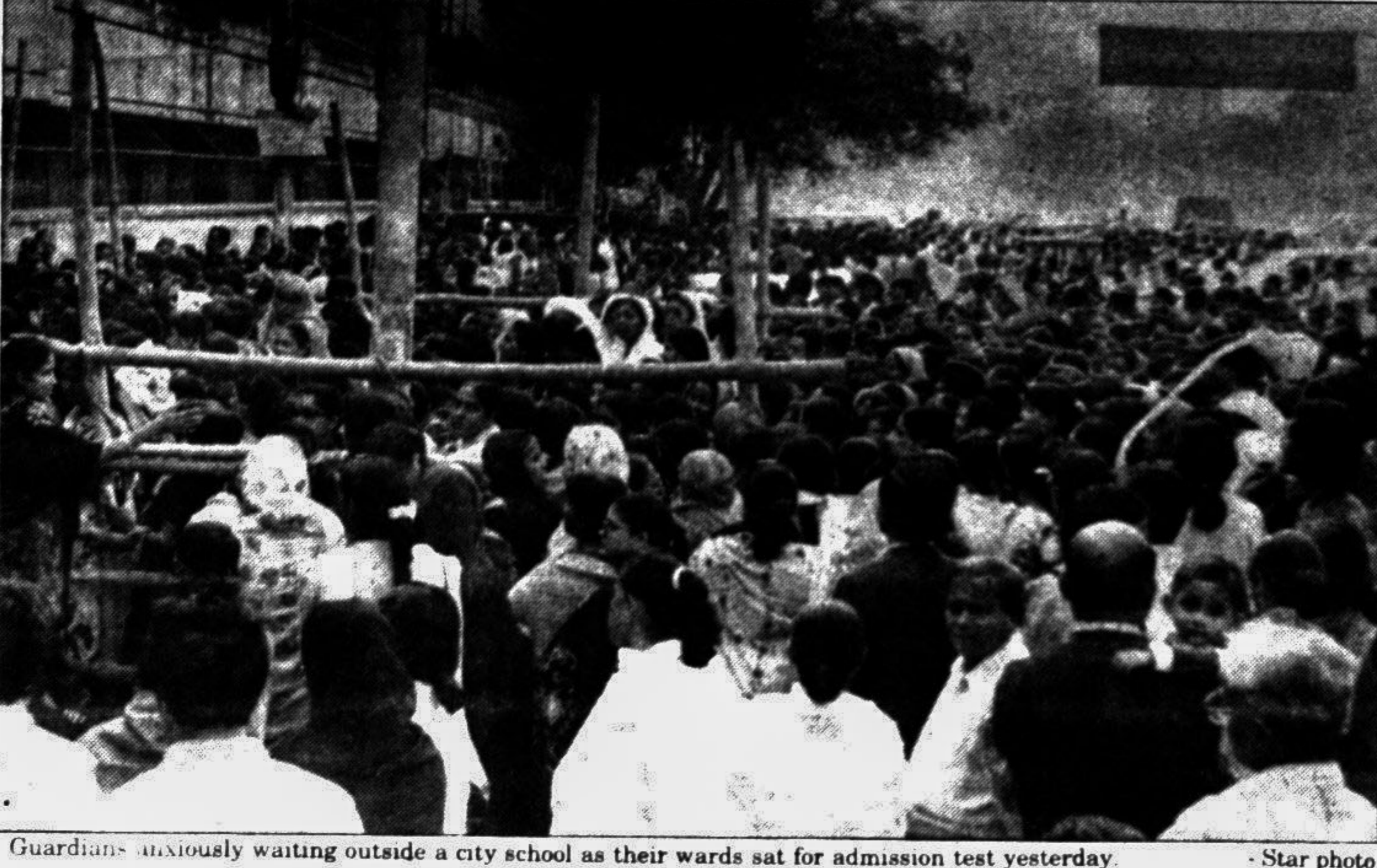
Guardians anxiously waiting outside a city school as their wards sat for admission test yesterday.

By Staff Correspondent Resentment among a section of activists of the BNP and its front organisations, protesting nomination of party candidates for the upcoming polls, continued yesterday in different areas of the country and hartals were observed in some places. Factions of BNP, Jatiyatabadi Chhatra Dal (JCD) and Jubo Dal enforced hartals and announced party nominees as 'persona non grata' in different constituencies yesterday. Our Staff Correspondent reports from Chittagong: Normal life was disrupted at Rangunia thana yesterday as supporters of a faction of BNP enforced a dawn to dusk hartal in protest against the nomination of Adil Hossain as party candidate for Chittagong-7 constituency. They barricaded Chittagong-Kaptal road and demanded giving nomination to Nurul Alam, president of Rangunia thana BNP, instead of Adil Hossain, who is the son of erstwhile East Pakistan Governor Zakir Hossain. Fisheries and Livestock Minister Abdullah Al-Noman could not attend the scheduled closing ceremony of a