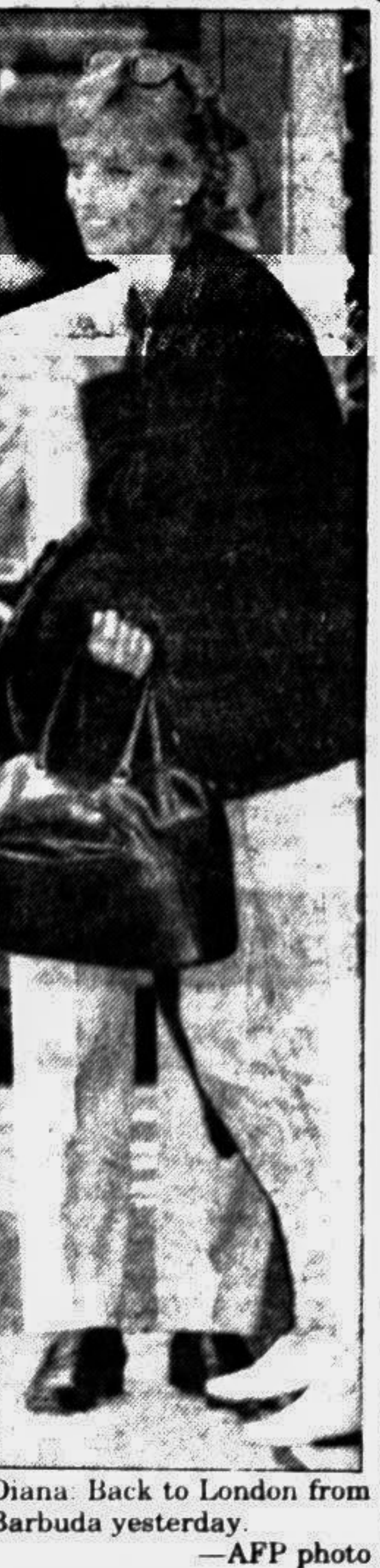
Diana: Back to London from Barbuda yesterday.

LONDON, Jan 4. Princess Diana has finally agreed to divorce Prince Charles, according to a newspaper report Wednesday night, reports AP. The Daily Express said she has told close advisers she now reluctantly accepts her marriage to Charles is over. Thursday's issue of the London tabloid, available Wednesday night, said she will hold talks with her legal advisers next week and quoted an unidentified close source saying: "you can expect moves toward a divorce to begin in earnest after Diana's meeting." "She has a lot of confidence in them and they have always advised her not to rush into anything but to let them (Charles' legal team) come to us. That is the little she has been taking but now everyone accepts they have come to the end of the road and decisions have to be taken." Charles and Diana separated in 1992 after 11 years of marriage and the birth of sons Prince William, 13, and Prince Harry, 11. Charles' mother, Queen Elizabeth II, wrote to Charles and Diana last month urging them to divorce soon. Charles agreed but Diana has made no reported reply to the queen. A Daily Express rival, the Daily Mirror, on Monday carried a similar but less detailed report, quoting See Page 8 Col 8