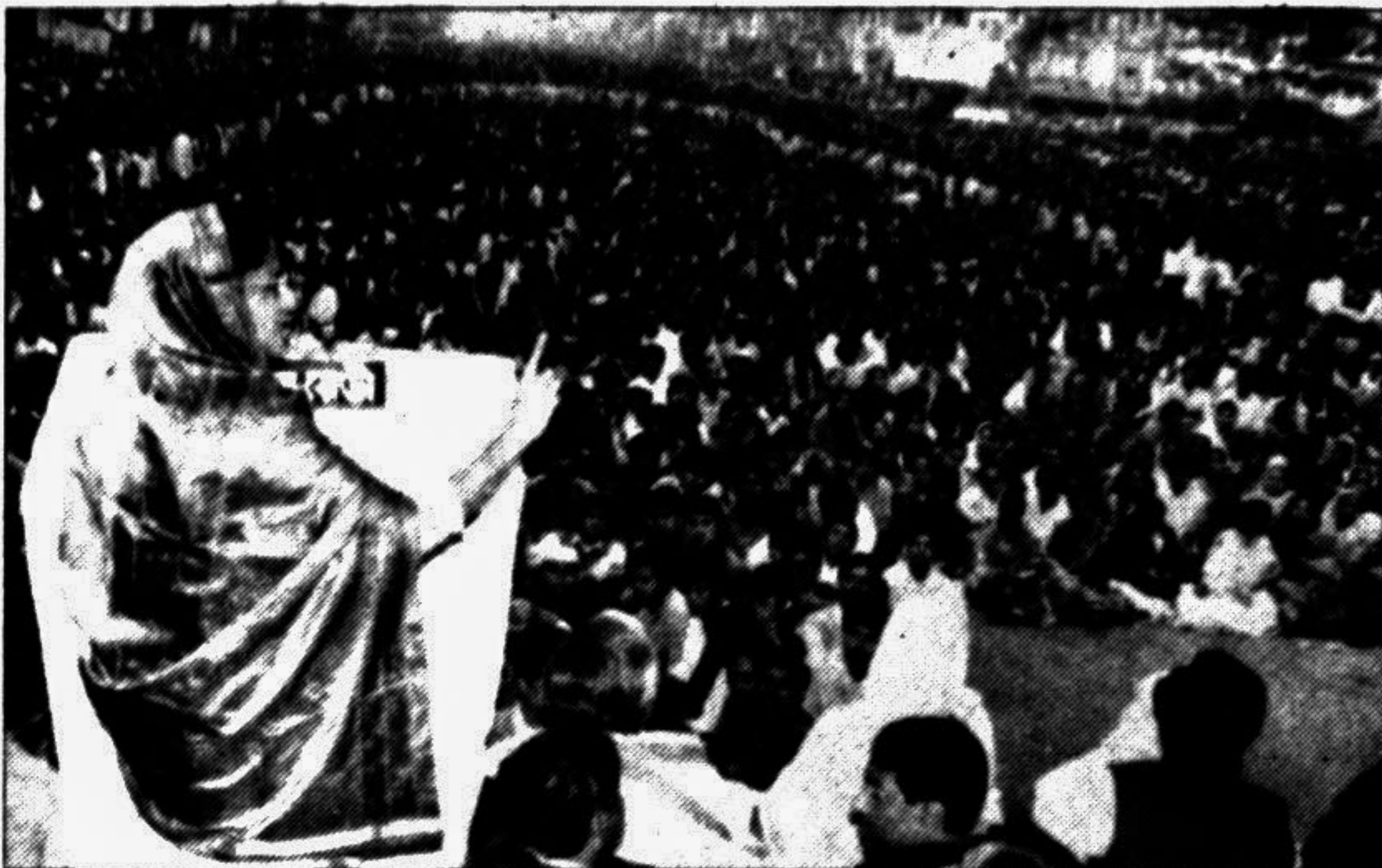
Awami League President Sheikh Hasina addressing a public meeting at Bangabandhu Avenue in the city yesterday.

The police said explosives had been seized from the three men along with a remote-control device which was to have triggered the bomb.