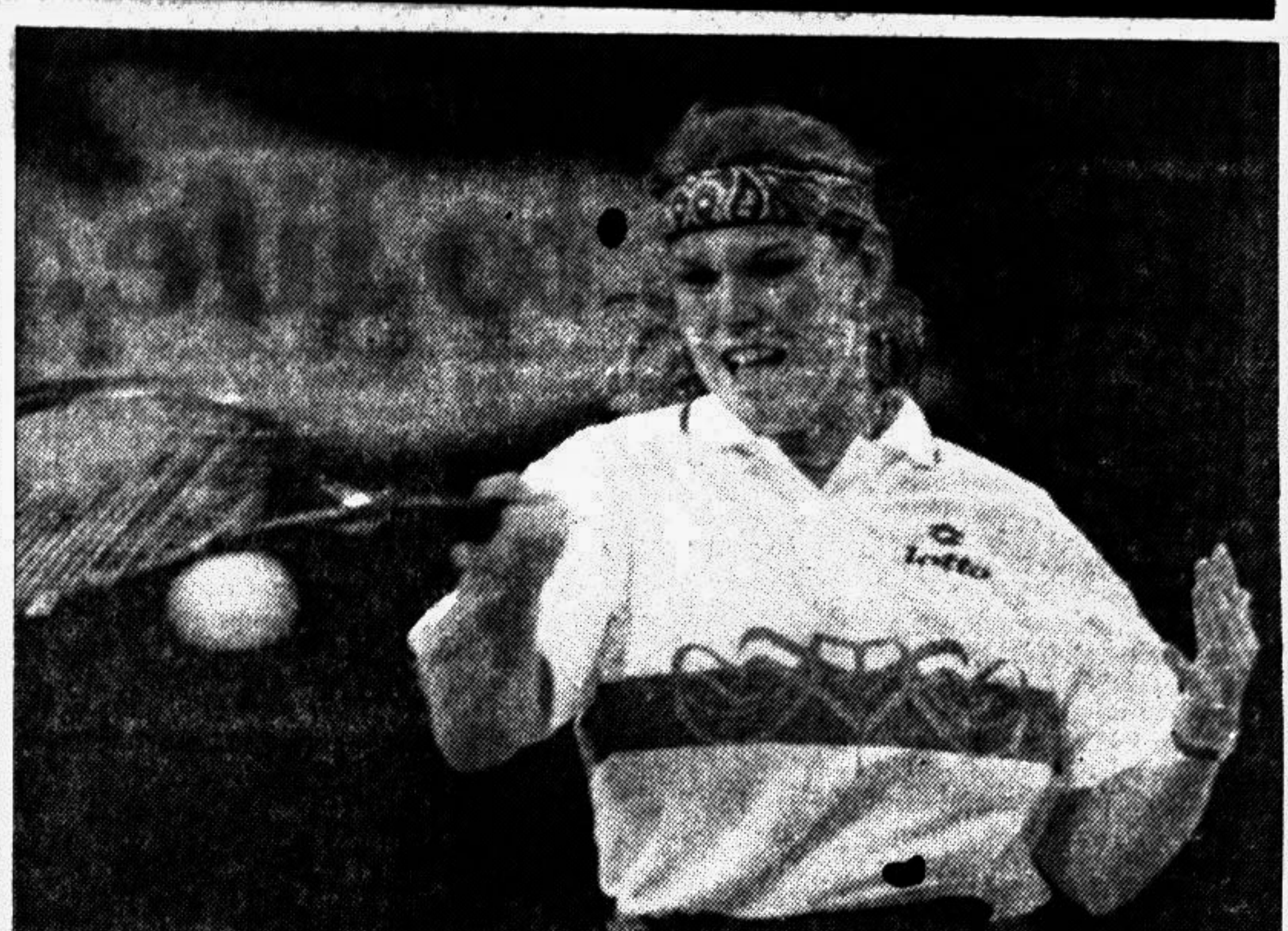
German Anke Huber returns a forehand against Dutch opponent Brenda Schultz-McCarthy during their Hopman Cup match in Perth on Jan 2. Huber won 3-6, 6-4, 7-6 (8-6).

"He is in a fair bit of pain and we won't know how it is for a couple of days until it settles down. Sometimes these problems can go away in a few days but other times it can take a bit longer. The truth is we just don't know at the moment and we'll have to wait and see."