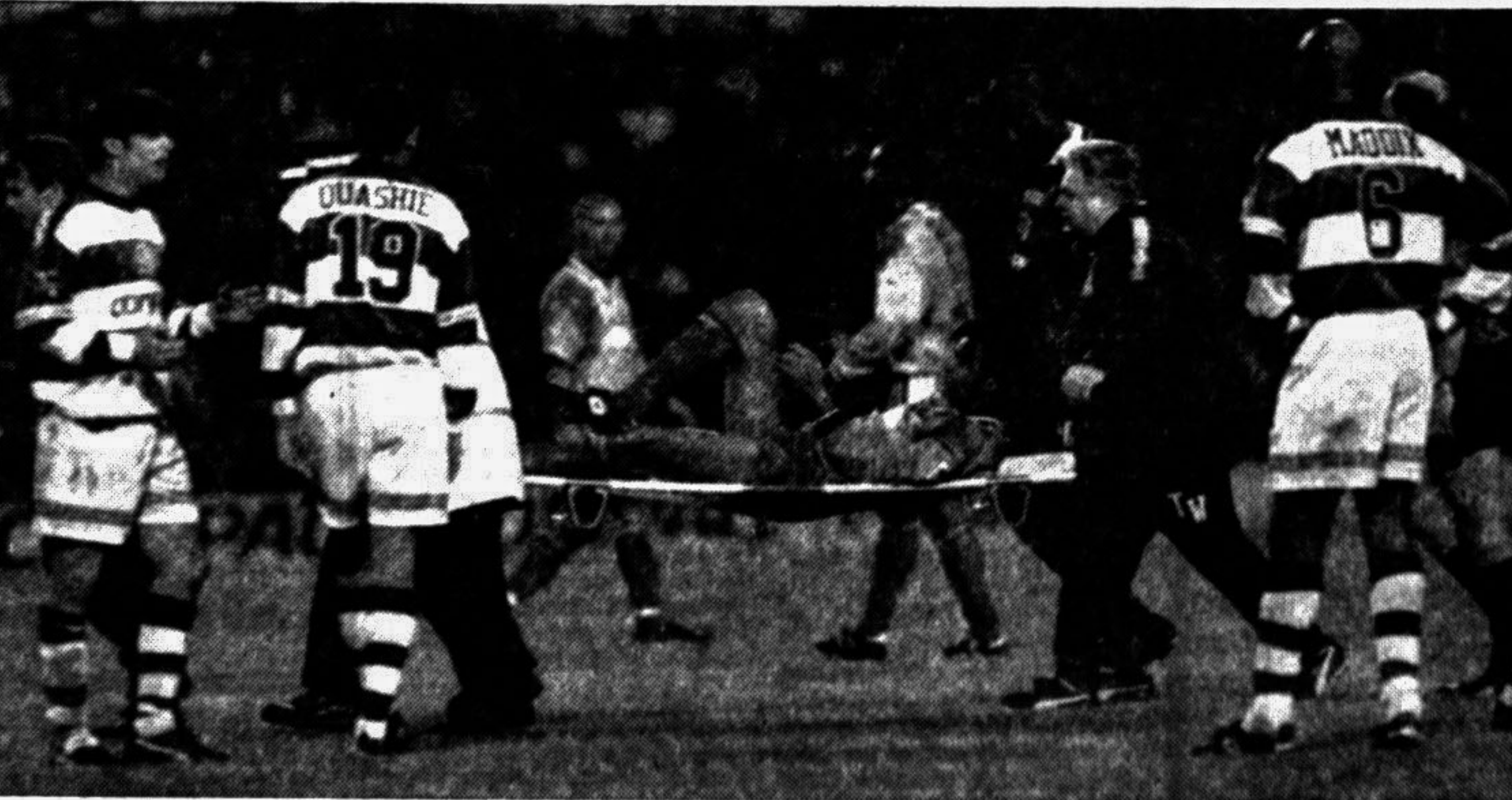
An injured Ruud Gullit of Chelsea is carried off the pitch on a stretcher during the English Premier league encounter against Queen's Park Rangers at Loftus Road in London on Jan 2.

Thailand has also drawn up a detailed plan for construction of the facilities required for the Asian Games, which are all due to be finished six months before the event begins.