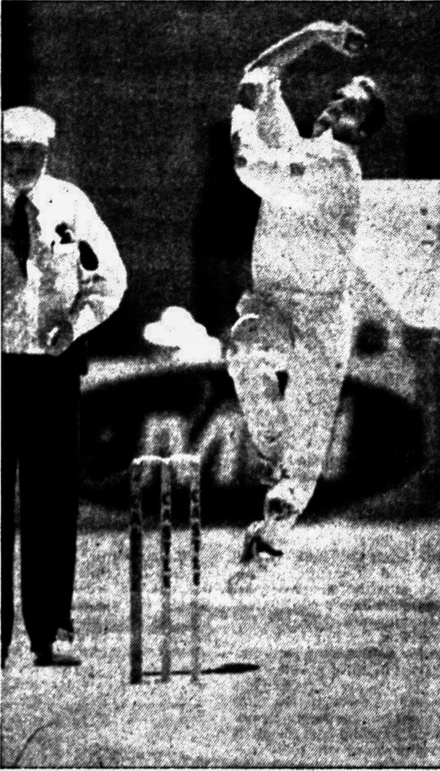
England all-rounder Dominic Cork on his way to bowl Darryl Cullinan of South Africa during the second day of the fifth and final Test against South Africa in Cape Town on Jan 3.

After the match, England paceman Dominic Cork went for X-rays to his left finger, injured early in South Africa's innings.