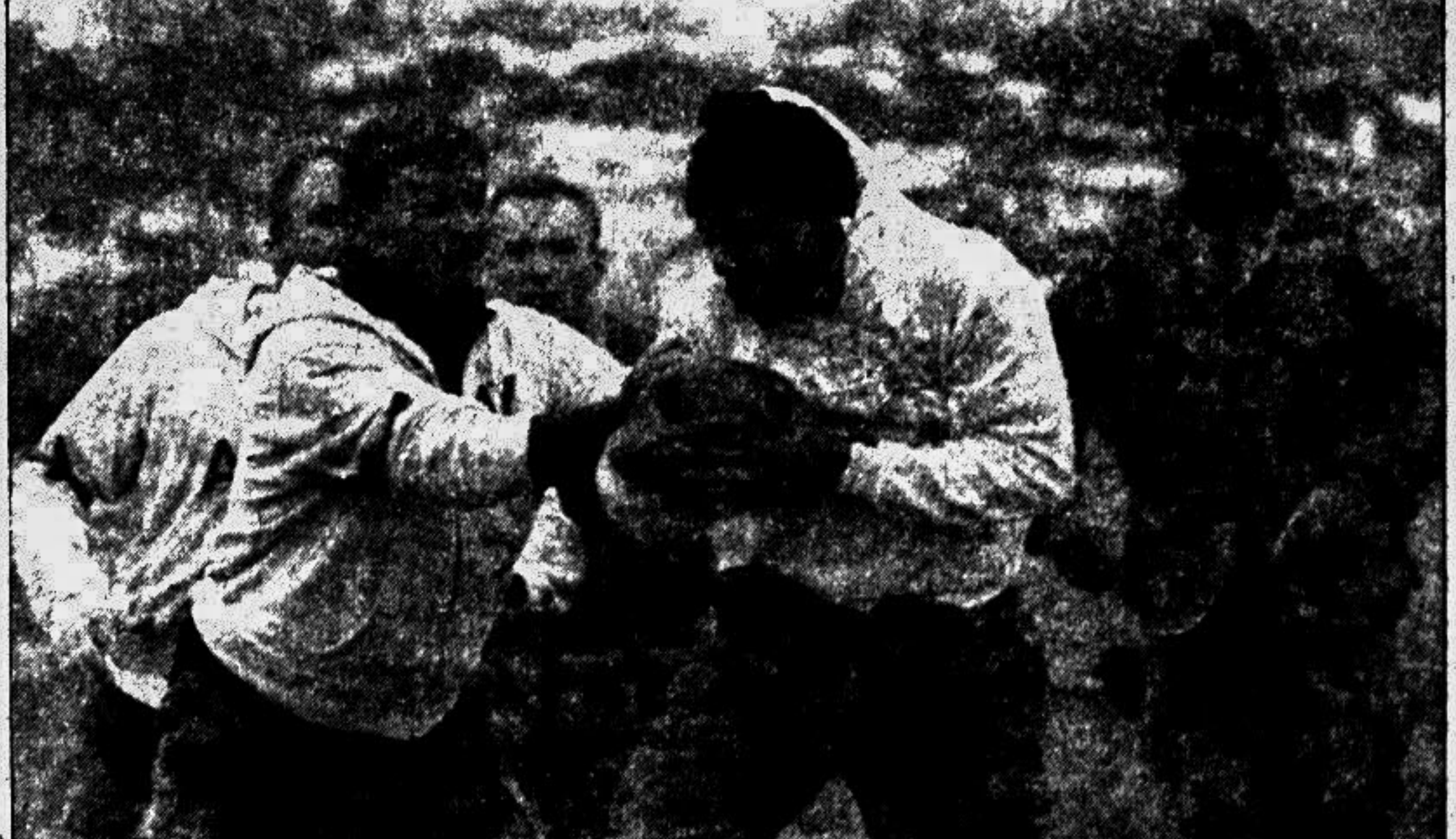
US soldiers of the NATO peace implementation force (IFOR) are engaged in an American version of football with their British counterparts in Sarajevo on New Year's Day.

On Monday the top-seeded Croatian combination of Goran Ivanisevic and Iva Majoli breezed to a 3-0 win over the No 8 seeded pair from France: Arnaud Boetsch and Catherine Tanvier. The Croatian pair won 3-6, 6-1 (7-4). The match was decided by a sudden death tie-breaker after the teams split the first two sets.