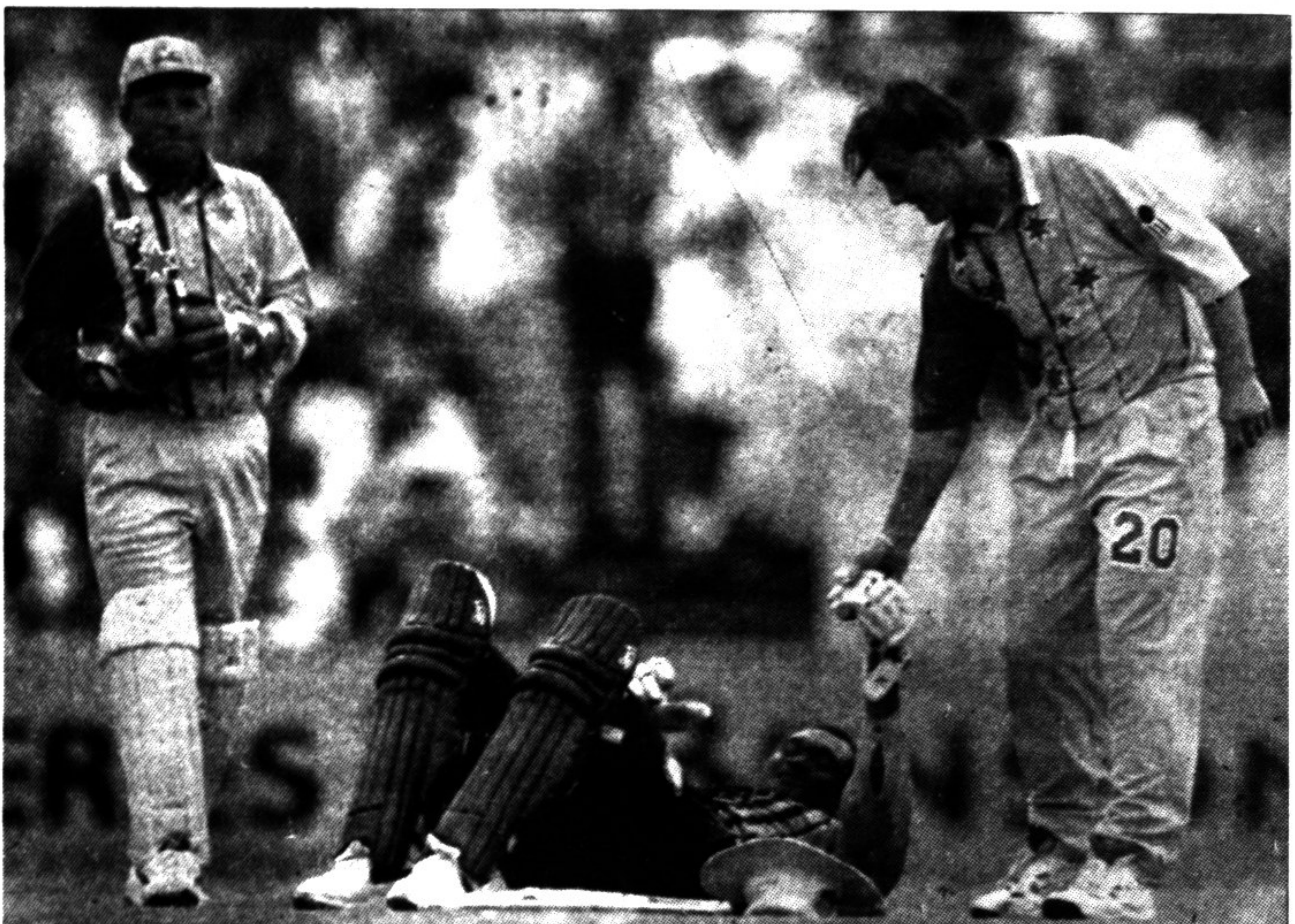
Windies' top scorer (93 not out) Carl Hooper (C) gets a helping hand from Australian all-rounder Shane Lee (R) while wicketkeeper Ian Healy looks on during yesterday's World Series Cup match at the Sydney Cricket Ground.