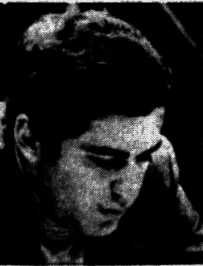
Garri Kasparov (World chess champion) "Anand lacks stamina and he was not playing like himself."

On why the Indian Grand Master lost to him.