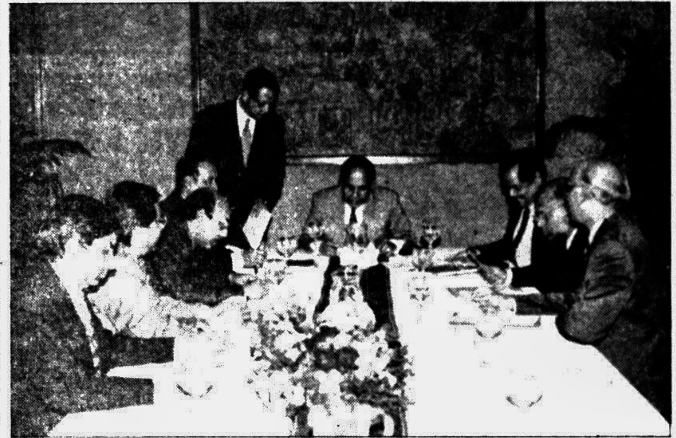
The 17th annual general meeting of the shareholders of Hotels International Ltd, the Owing Company of Sonargaon Hotel, was held on Thursday. Maj (Retd) Abdul Mannan, State Minister in-charge of the Ministry of Civil Aviation and Tourism and Chairman of the company presided over the meeting.

Two new digital exchanges, each with a capacity of 2,000 lines at Sagorika and Bayejid in the port city of Chittagong, started functioning technically from December 28, reports UNB. Some 660 lines of Sagorika exchange under EMD system were converted into digital and the EMD exchange was closed down, said a T&T Board press release yesterday. Following introducing of the digital system, the previous 5-digit analogue telephone of Sagorika has been turned into a 6-digit digital number. Now, one more digit — seven — is needed to be dial before the previous five digit number of Sagorika exchange. For instance, a telephone number which earlier was 51000, is now 751000. The previous 1900-line EMD exchange will remain in operation with the new 2,000-line digital exchange at Bayejid, the press release added.