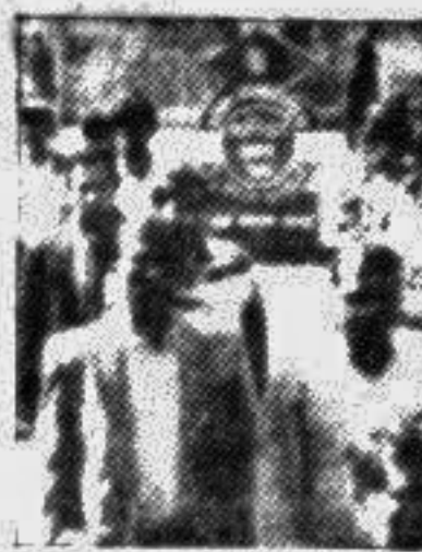
On the Death of a Teacher Page 3