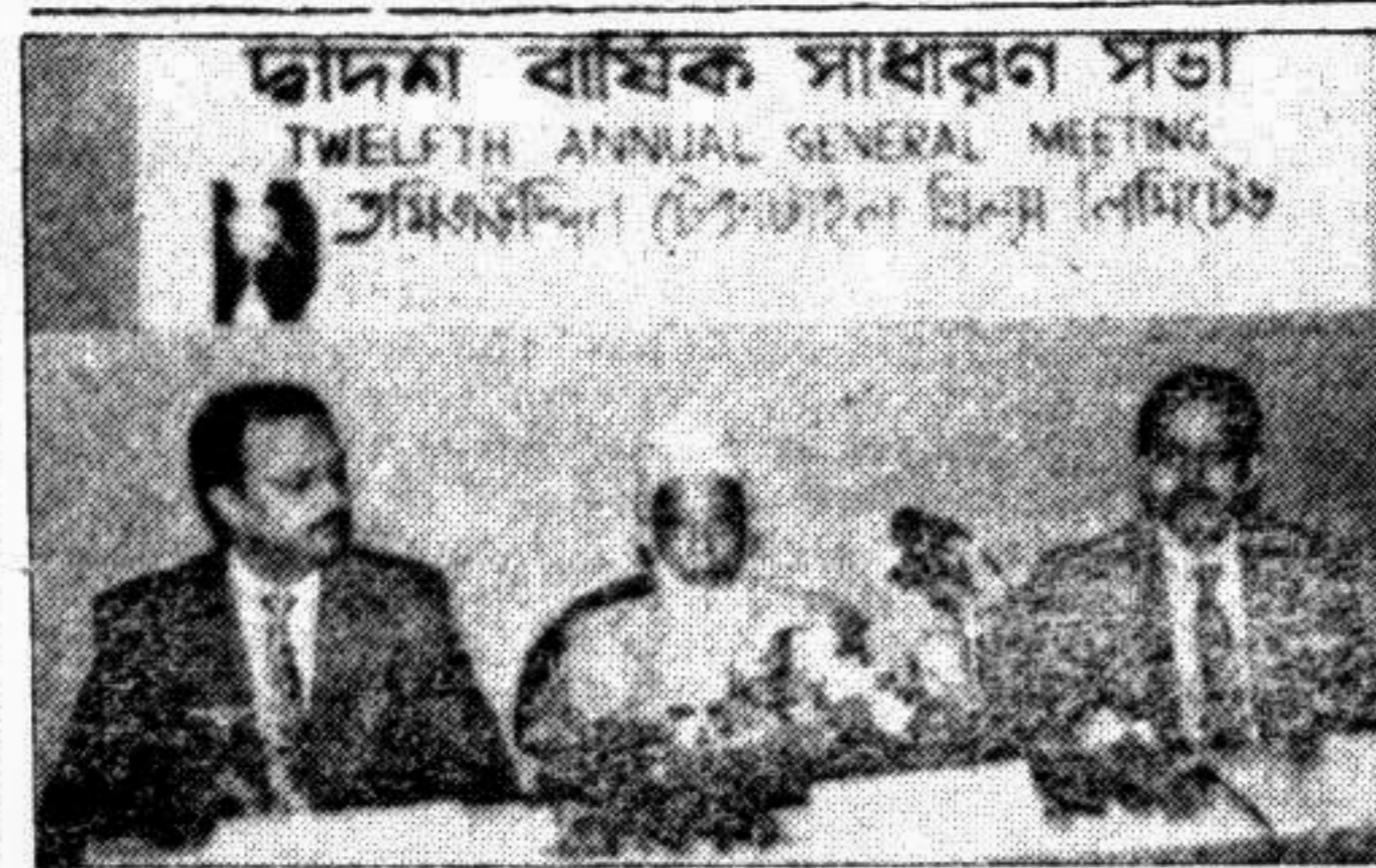
The 12th AGM of Tamijuddin Textile Mills Ltd was held at a city hotel on Thursday.

The meeting declared a 20 per cent dividend and the shareholders present in the meeting unanimously approved it. The shareholders also expressed full satisfaction at the company's activities during the last year.