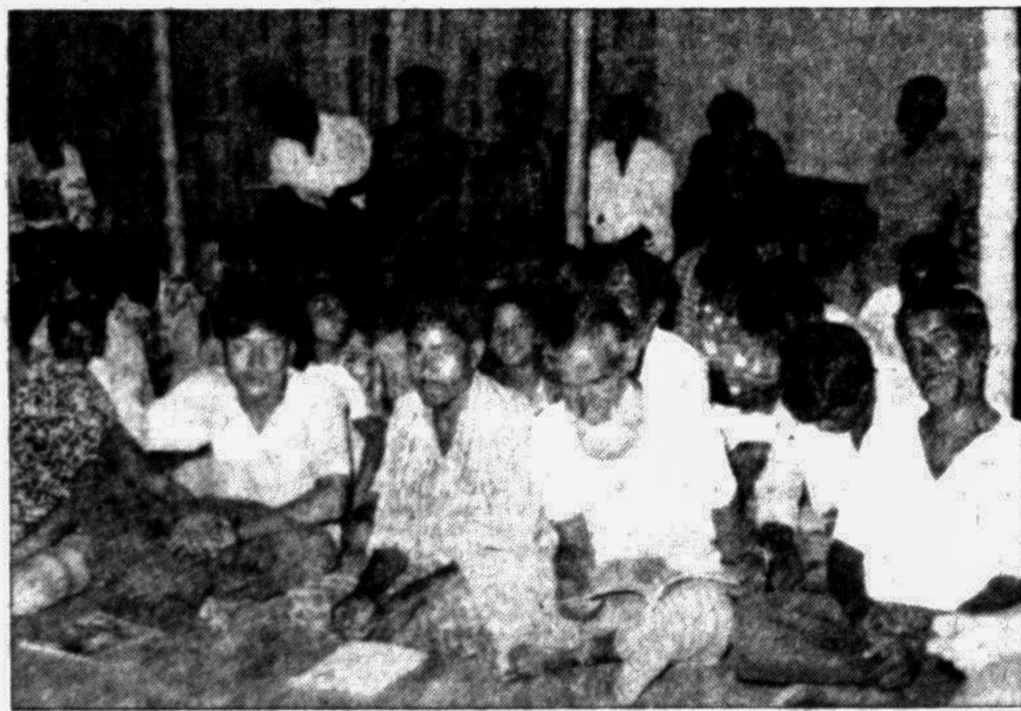
Students attend a mass education centre.

The male and female students in these mass education centres are being given lessons separately. For the successful implementation of the programme there is a centre conducting committee for each mass education centre for running the centre. The centre committee consists of one president, one member-Secretary and five to seven members. The