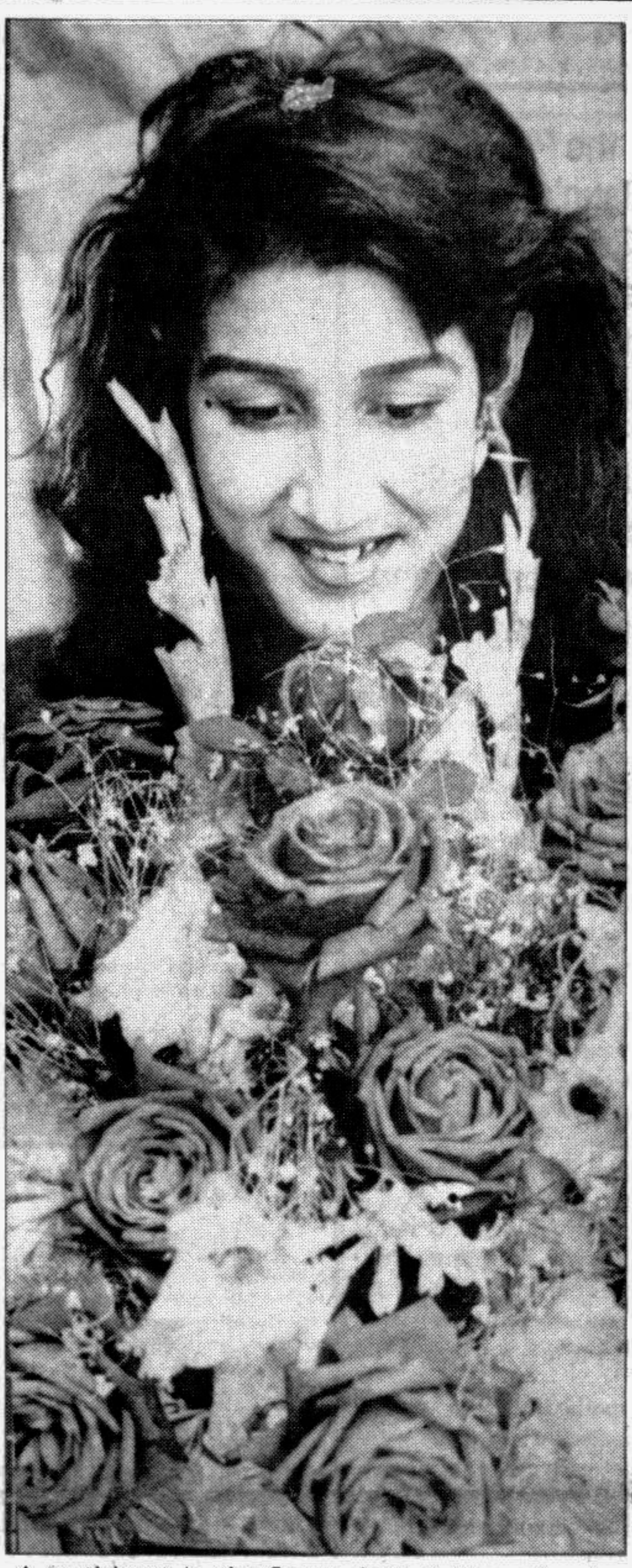
A participant in the flower show at Sher-e-Bangla Nagar in the city yesterday organised by Parjatan Corporation marking the tourism month.

Election Commission yesterday directed the district and thana police administration to file cases and take legal action against the intending candidates using multi-colour poster, banner and graffiti for election campaign, reports UNB. Earlier, the EC asked the people concerned to erase their graffiti and remove multi-colour poster and banner by December 25. According to an EC press release, the use of multi-colour poster, graffiti and banner for election campaign is an electoral offence as per the Representation of People Order, 1972, section 44B and 73. The EC also urged the owners of house, office and institution to lodge complaint to their respective police station, DC or Police Super against the people involved in wall-writing, postering, and hanging banner on the walls and premises of their houses. Arms recovery Law enforcing agencies recovered 45 illegal firearms on the eighth day yesterday of the combined operation See Page 12 Col 8