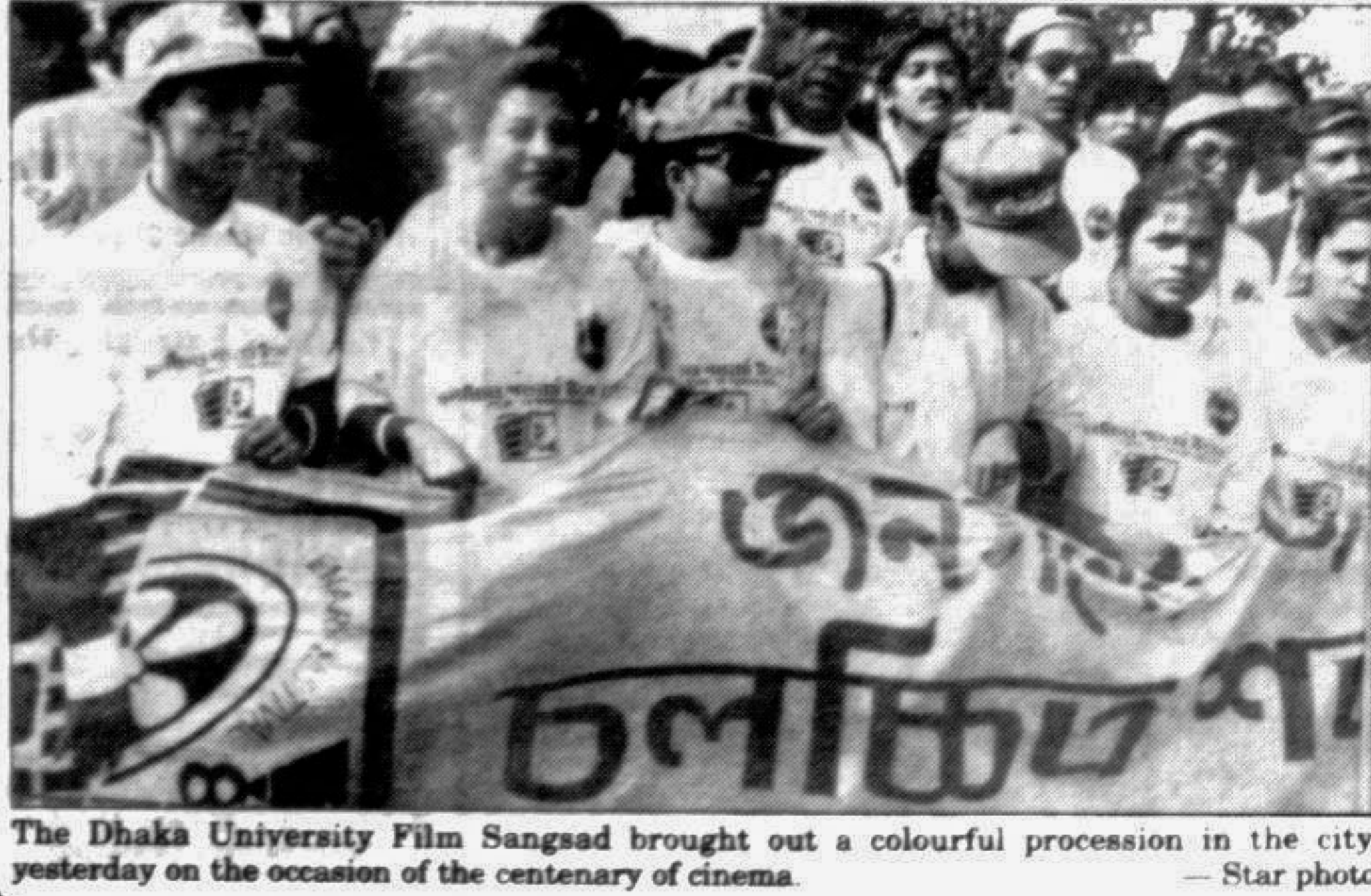
The Dhaka University Film Sangsad brought out a colourful procession in the city yesterday on the occasion of the centenary of cinema.

PARIS, Dec 28: The cinema starts its second century here today, 100 years to the day after the Lumiere brothers — Louis and Auguste — staged the first public projection of a film before an audience of 33 at a Paris cafe, reports AFP. In commemoration, a giant inflatable screen — 30 meters wide — has been put up on the Trocadero Esplanade near the Eiffel Tower, where it will remain until January 1. Strollers, tourists and cinema buffs will be able to view several films on the origin of the cinema as well as a special tribute by 40 directors from around the world — each one of whom shot a 52-second sequence with the very camera used by the Lumiere brothers. Among the directors featured are Merzak Alouache