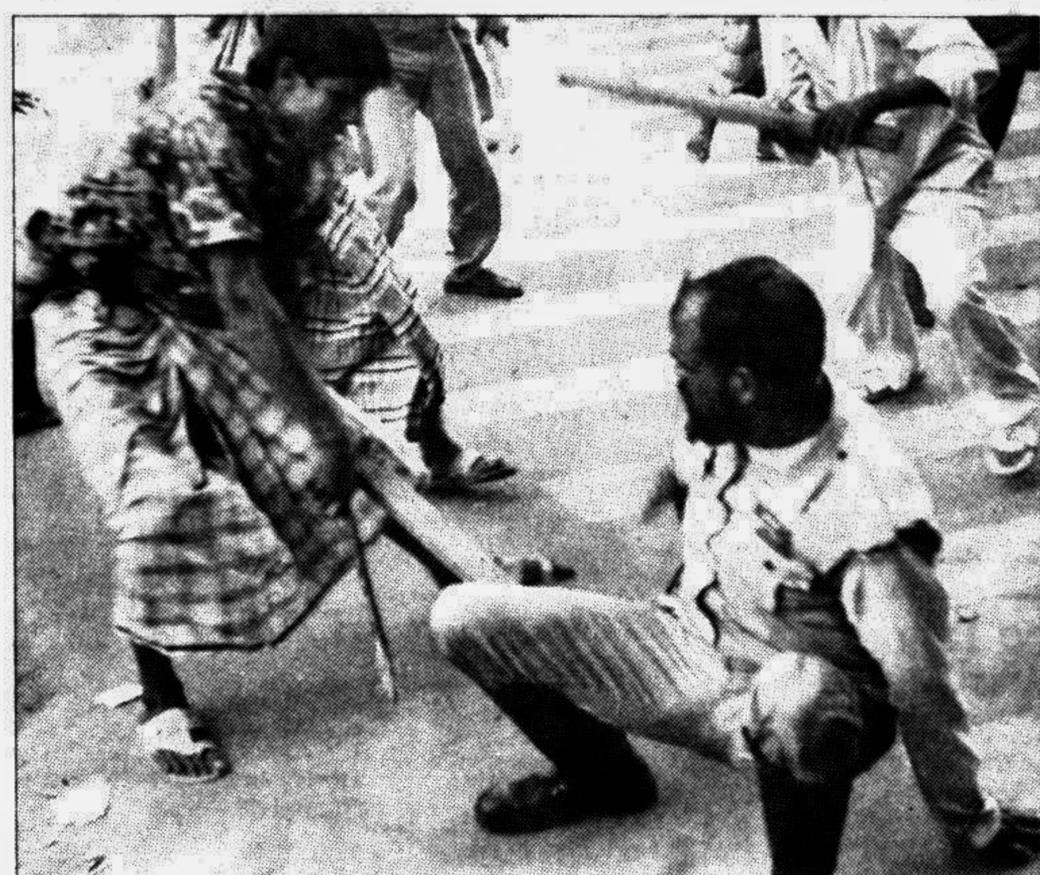
Police beating up a traffic police at the Danak Bangla crossing in the city yesterday.