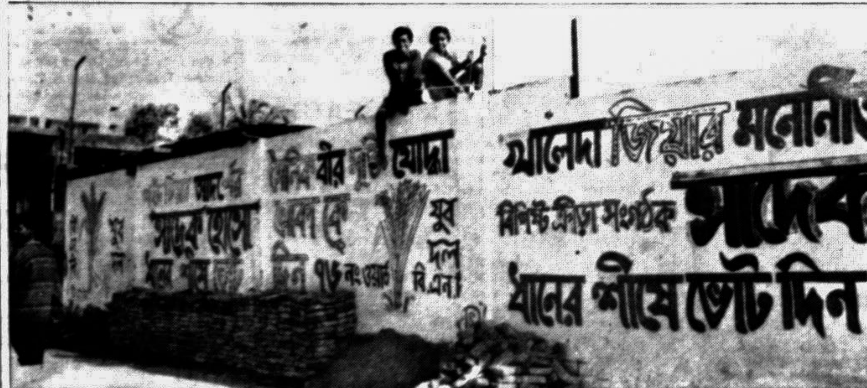
WARNING GOES UNHEEDED: Leading political parties have not heeded to the directives by the Election Commission to erase graffiti from walls even after expiry of the deadline Monday.

By Staff Correspondent Although the deadline to erase all political graffiti and remove multi-coloured posters from the walls expired Monday, those are still on the city walls. There is hardly any drive to clean the walls. However, no fresh attempt was seen to put up graffiti or posters. Majority of these graffiti and posters seen in most areas of the city are written in favour of the ruling BNP. One graffiti says "La-t-laha illallah, Dhaner Shishey Bismillah (La-t-laha illallah, vote for paddy sheaf)" while a multi-colour poster with a photograph of Prime Minister Begum Khaleda Zia simply says, "ganotantra enecht, ganotantra rakhbo" (I brought democracy, I will safeguard democracy). All these graffiti and posters were put on the walls at least few weeks ago. However, some arches erected at different parts of the city by BNP party workers earlier this month have been dismantled. The Election Commission (EC) on Monday instructed police at thana and district levels to take legal actions against persons or organisations putting up graffiti or multi-coloured posters on walls. The EC directive also bars erection of arches or pandals bigger than 400 square feet. According to Sections 73 and 44 (b) of the People's Representation Order of 1972, the violators can be arrested without any warrant and are punishable with minimum two years RI with fine or maximum seven years RI.