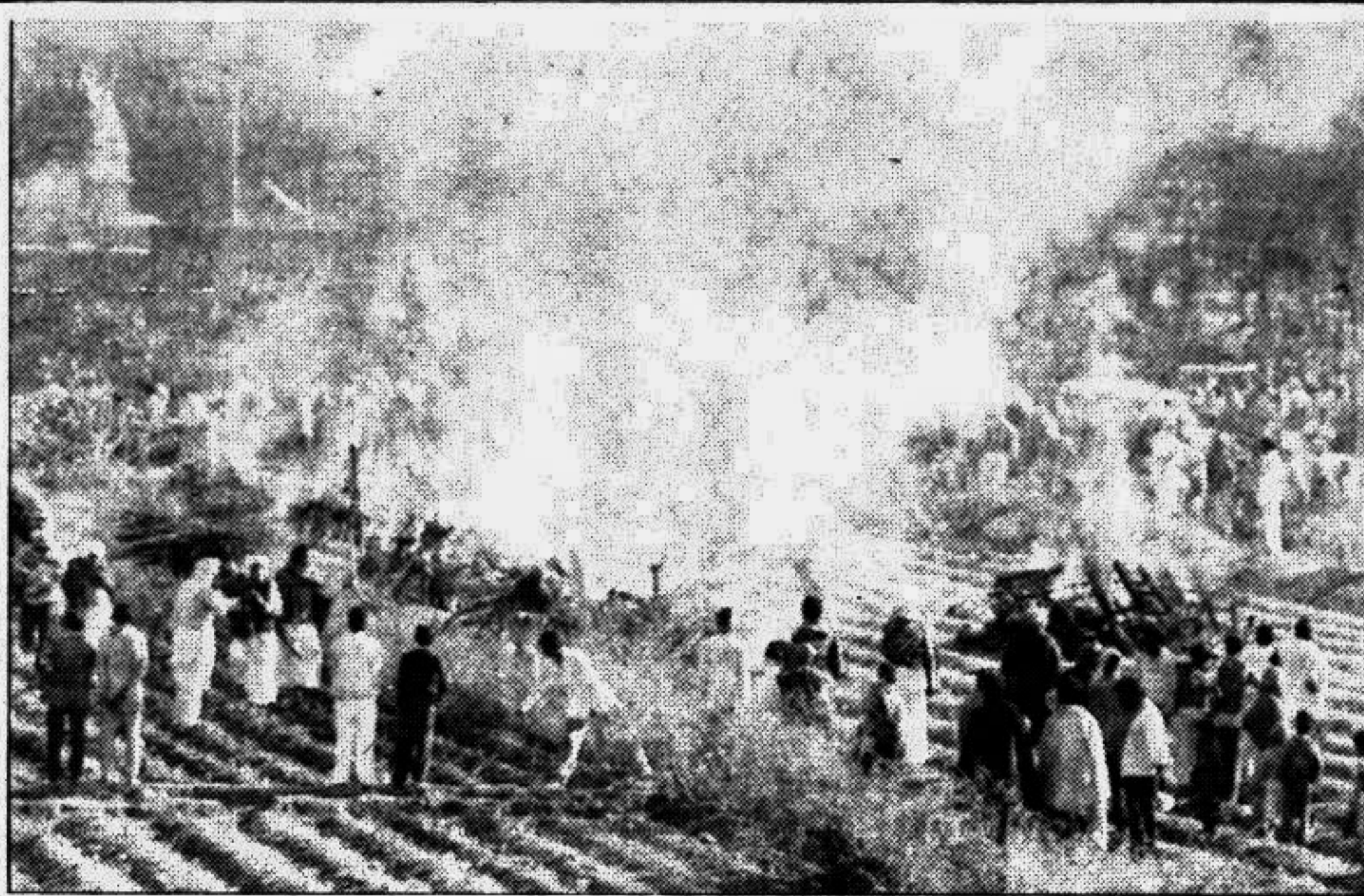
Dozens of funeral pyres burn in the northern Indian town of Dabwali Sunday where a devastating fire at a school party left more than 400 people dead.

The body will be buried at his village home at Chiora Khandirpur under Chouddagram thana of Comilla in the evening.