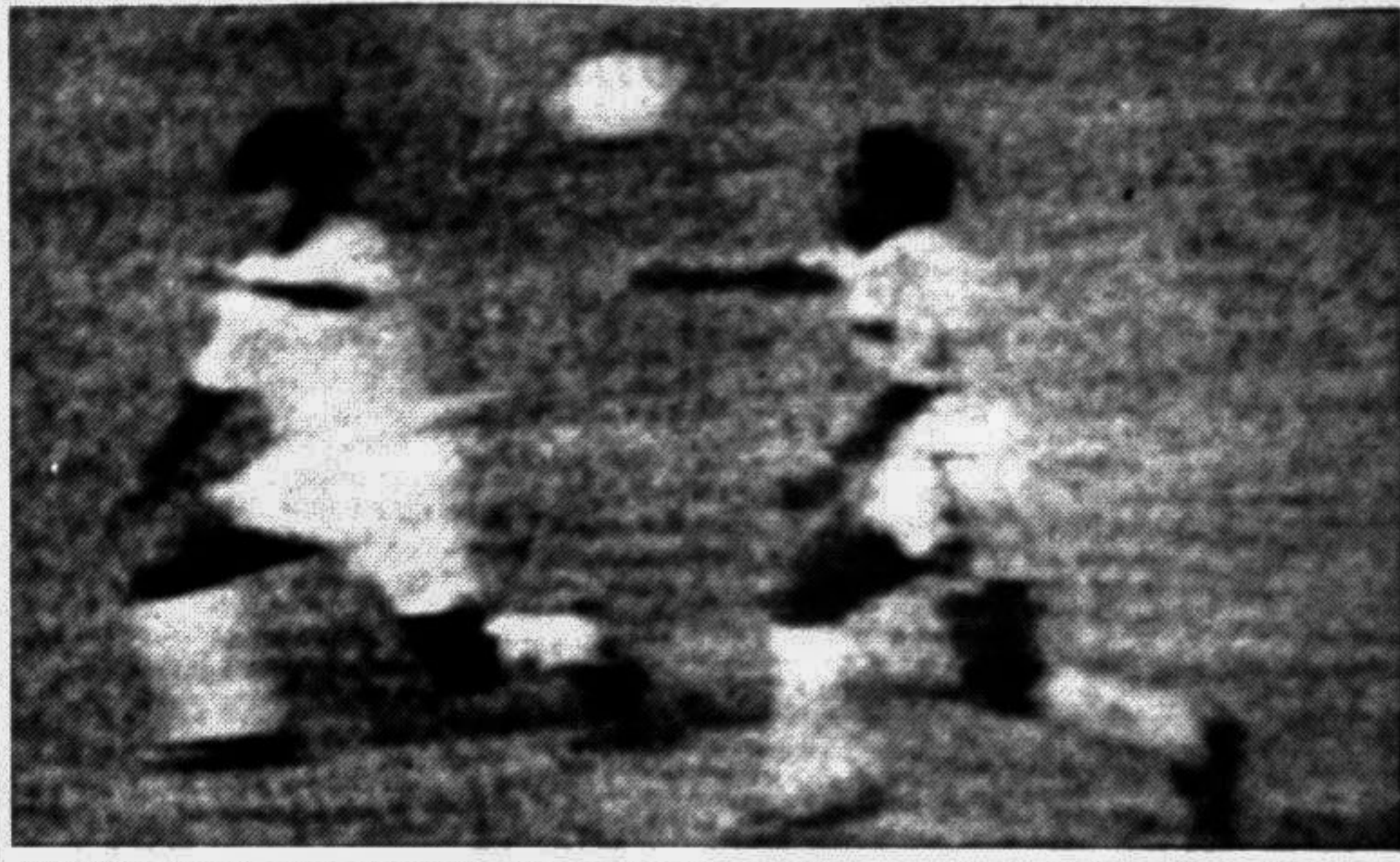
A Sri Lankan booter chases the ball as his Bangladeshi counterpart closes in to challenge during their SAF soccer semifinal at Nehru Stadium yesterday. Bangladesh won 5-4 on penalties after 120 minutes of play.