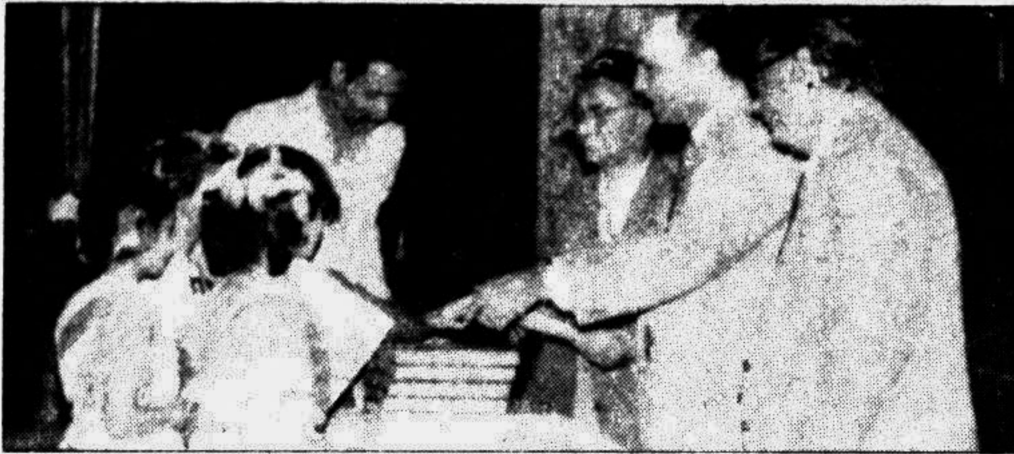
SYLHET: Divisional Commissioner Md Habibur Rahman distributing prizes among the winners of the divisional-level Moushumi Contest arranged by Shishu Academy recently.

They said all kinds of operations in the hospital remained suspended due to the water crisis.