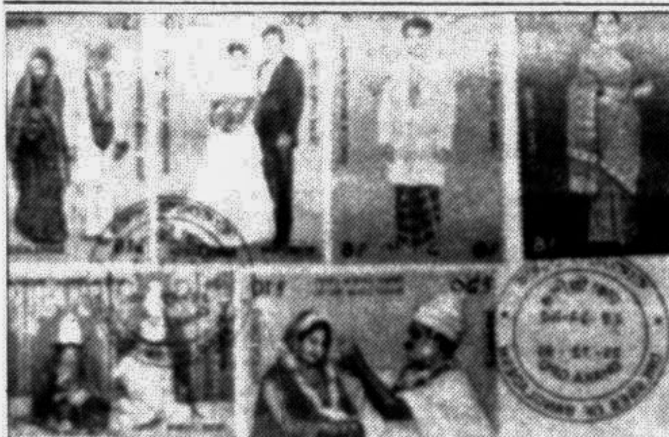
The Bangladesh Post Office yesterday issued two commemorative postage stamps of six taka denomination each, four stamps of ten taka each, and a first-day cover not in the picture valued Taka six on the local dresses.

Gonoshasthaya press confce: On the occasion of the inauguration of a hospital in the city, Gonoshasthaya Kendra will hold a press conference. Venue: Gonoshasthaya City Hospital. Time: 11 am.