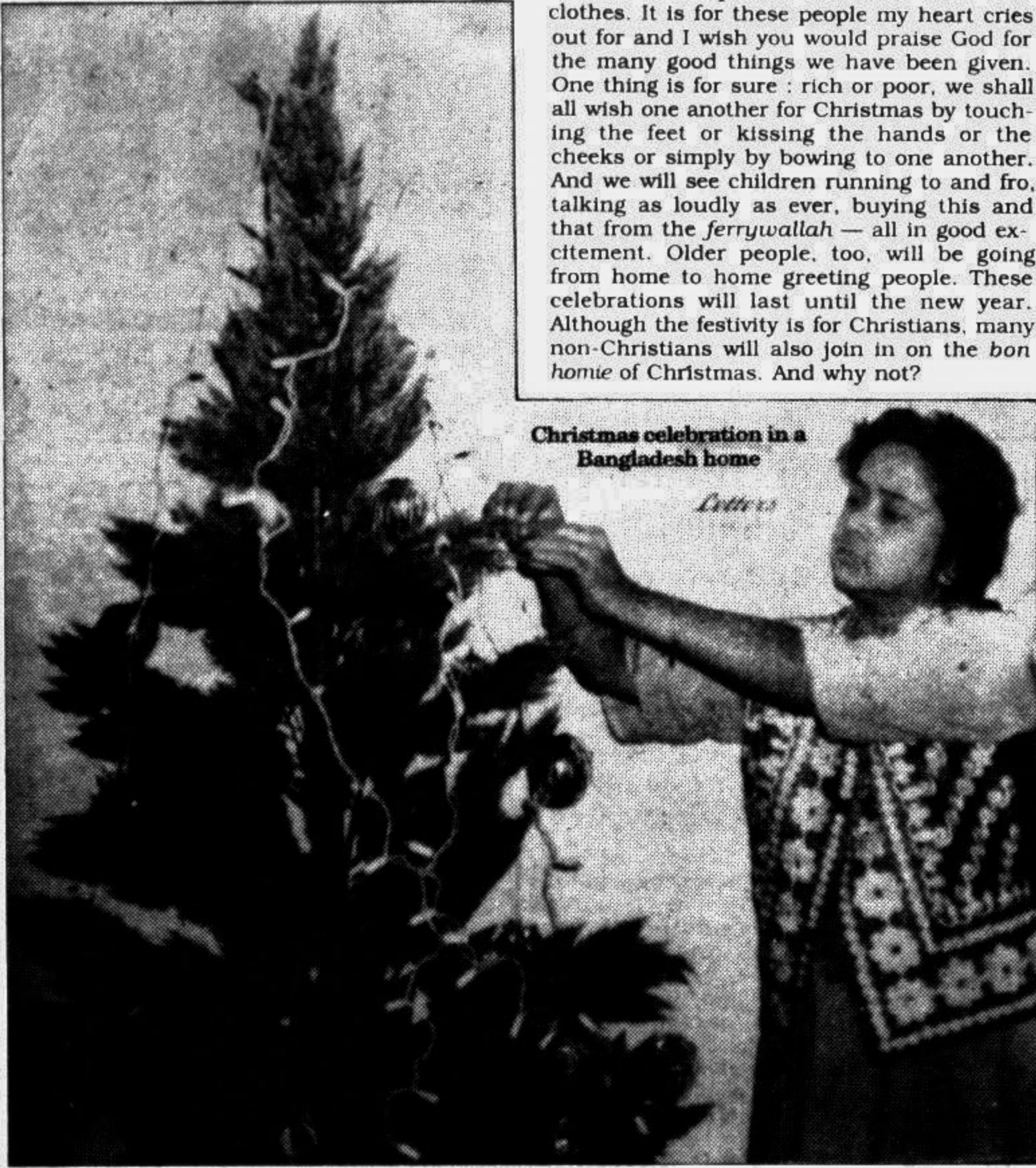
Christmas celebration in a Bangladesh home

and dear ones, at home and abroad, buy clothes, eat pithas and cakes, polao rice, meat and oranges in many homes. There will be gaiety, mirth and laughter in the air. But for many poorer people, Christmas will not bring this fare: they will not eat a sumptuous meal nor wear new clothes. It is for these people my heart cries out for and I wish you would praise God for the many good things we have been given. One thing is for sure: rich or poor, we shall all wish one another for Christmas by touching the feet or kissing the hands or the cheeks or simply by bowing to one another. And we will see children running to and fro, talking as loudly as ever, buying this and that from the ferrywallah — all in good excitement. Older people, too, will be going from home to home greeting people. These celebrations will last until the new year. Although the festivity is for Christians, many non-Christians will also join in on the bon homie of Christmas. And why not?