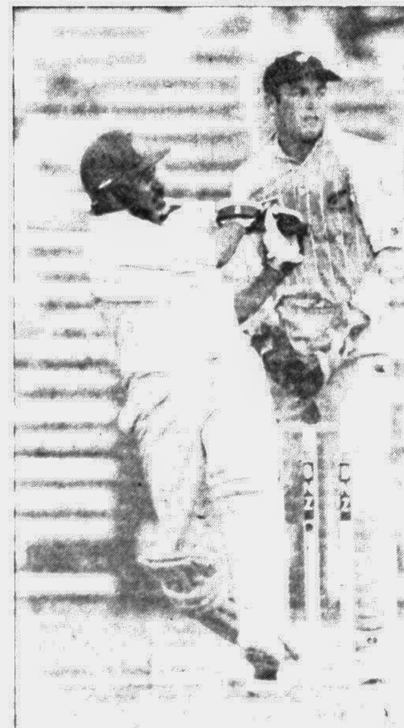
Salim Malik of Pakistan pulls his one during his top scoring knock of 58 against New Zealand in yesterday's final one-day international at Eden Park, Auckland.

and final one-day international between New Zealand and Pakistan at Eden Park on Saturday: