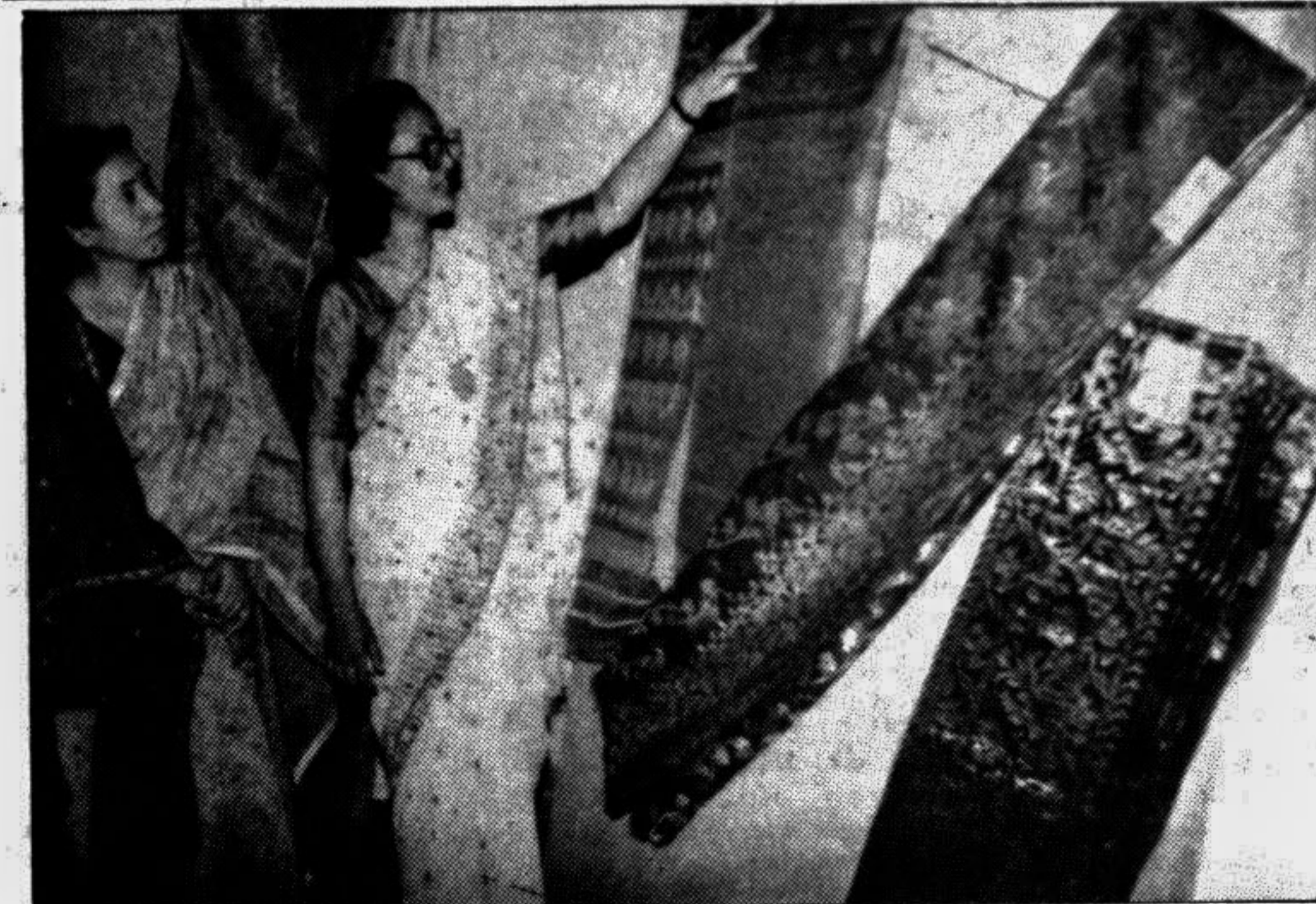
A nine-day Jamdani exhibition organised by Bangladesh Handloom Board began at Shilpakala Academy art gallery in the city yesterday.

Meanwhile the agriculture extension department has also taken up programme to set up 747 demonstration plots including 417 field crop demonstration plots, and 330 homestead demonstration plot. Moreover 220 other demonstration plots in different areas of the district will also be set up.