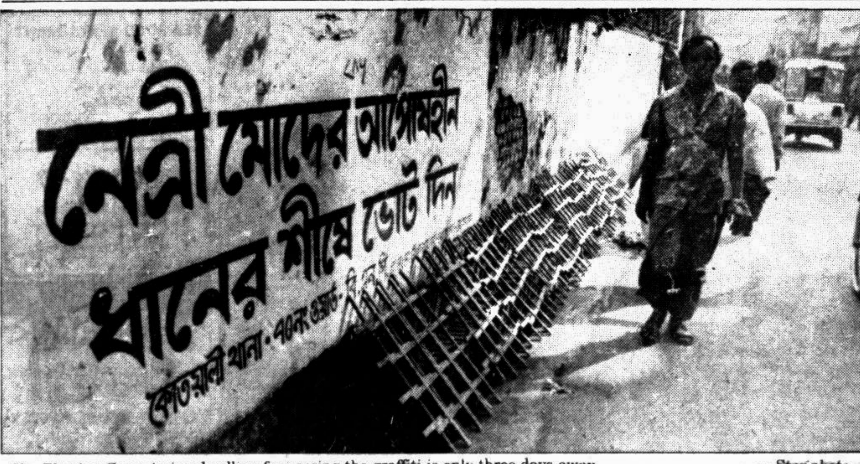
The Election Commission deadline for erasing the graffiti is only three days away.