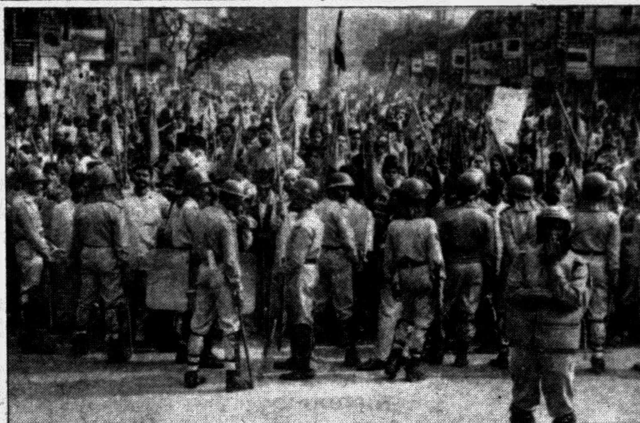
Police obstructing a procession of the Islami Chhatra Shibir at Purana Paltan crossing in the city during hartal hours yesterday.